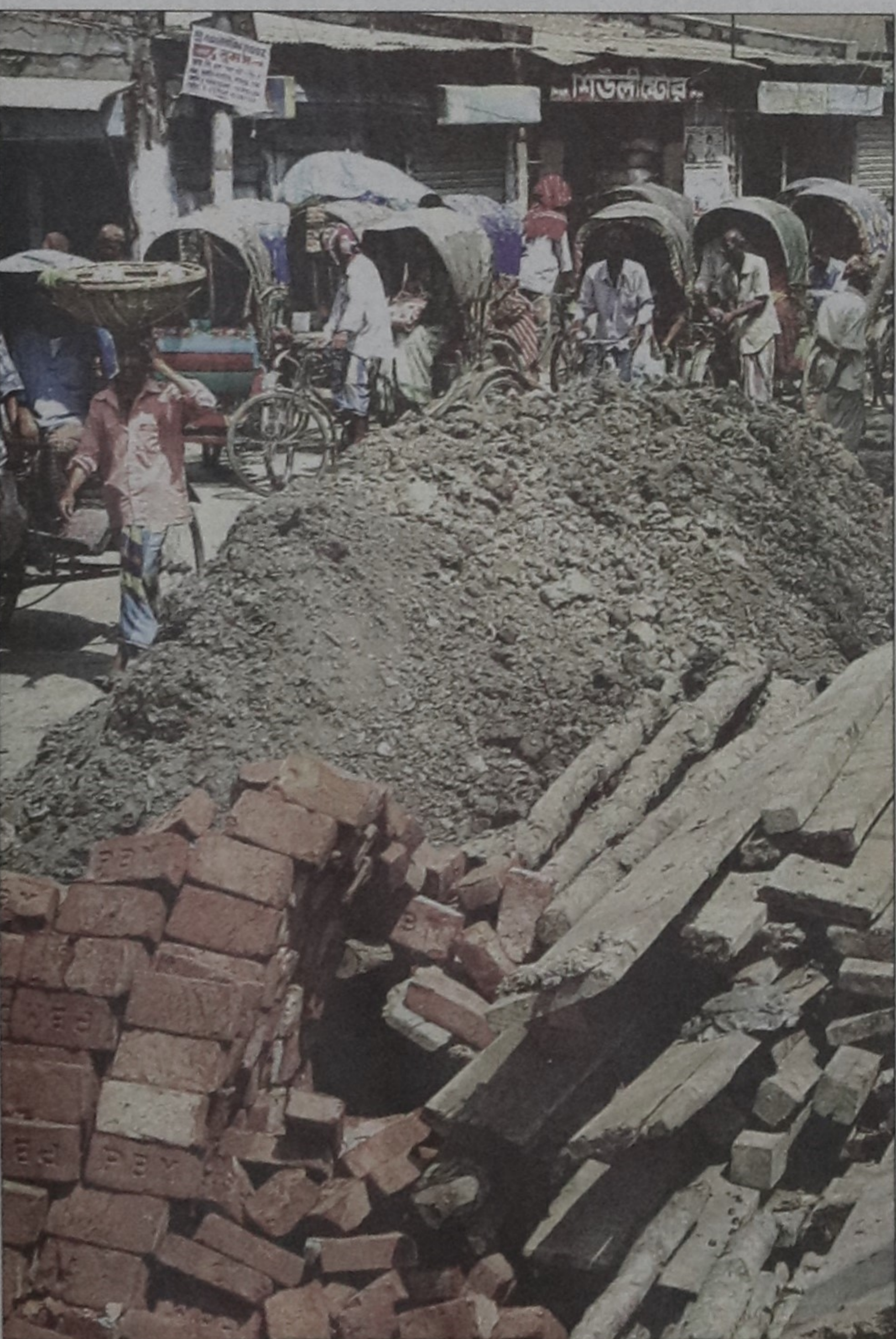
Bricks and logs left by Wasa workers on the road in the city's Faridabad area hinder smooth movement of vehicles. The picture was taken yesterday.