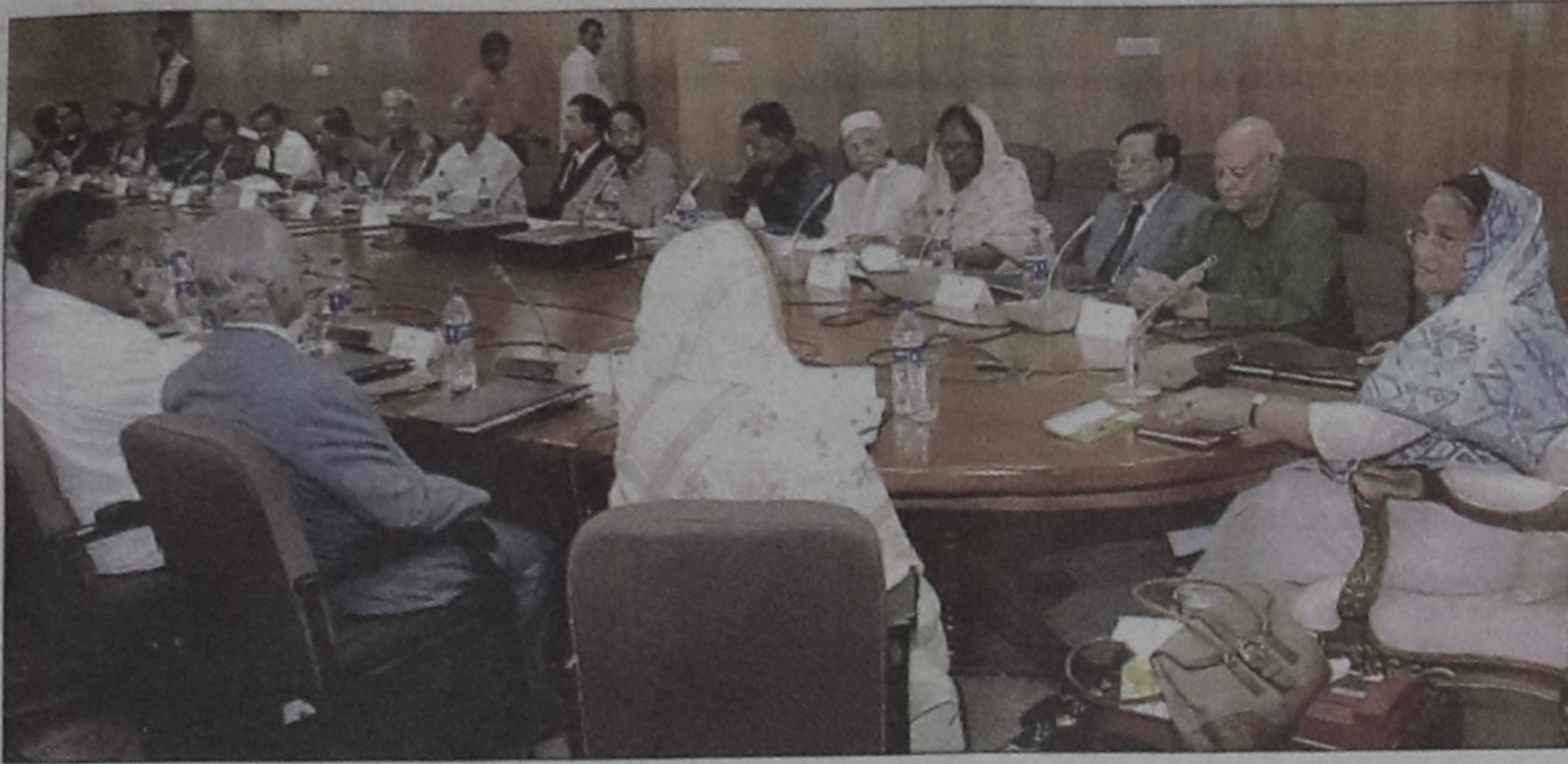
Prime Minister Sheikh Hasina presides over a cabinet meeting at the Secretariat in the city yesterday.