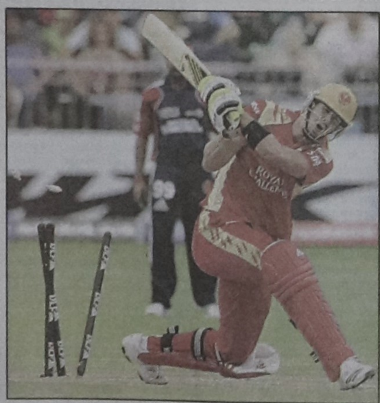
England batsman Kevin Pietersen of the Bangalore Royal Challengers plays and completely misses a switch-hit and is clean bowled during his side's IPL Twenty20 match against Delhi Daredevils at St George's Park in Port Elizabeth yesterday.