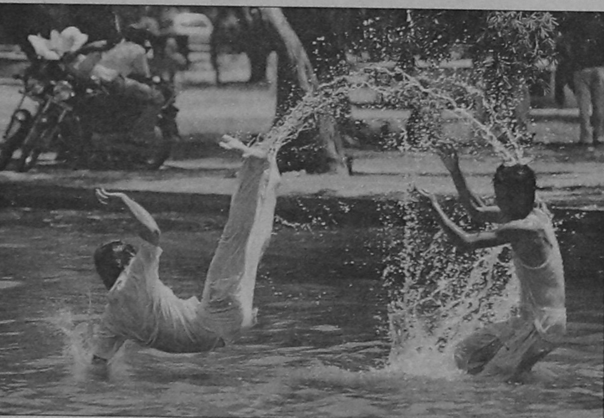
Indian boys play in a pool of water to beat the heat near India Gate in New Delhi yesterday. Several parts of northern India continued to experience mixed weather with the mercury fluctuating above and below normal. The maximum temperature in the capital shot up well above average due to dusty hot winds, with temperatures up to 40 degrees over the past few days.