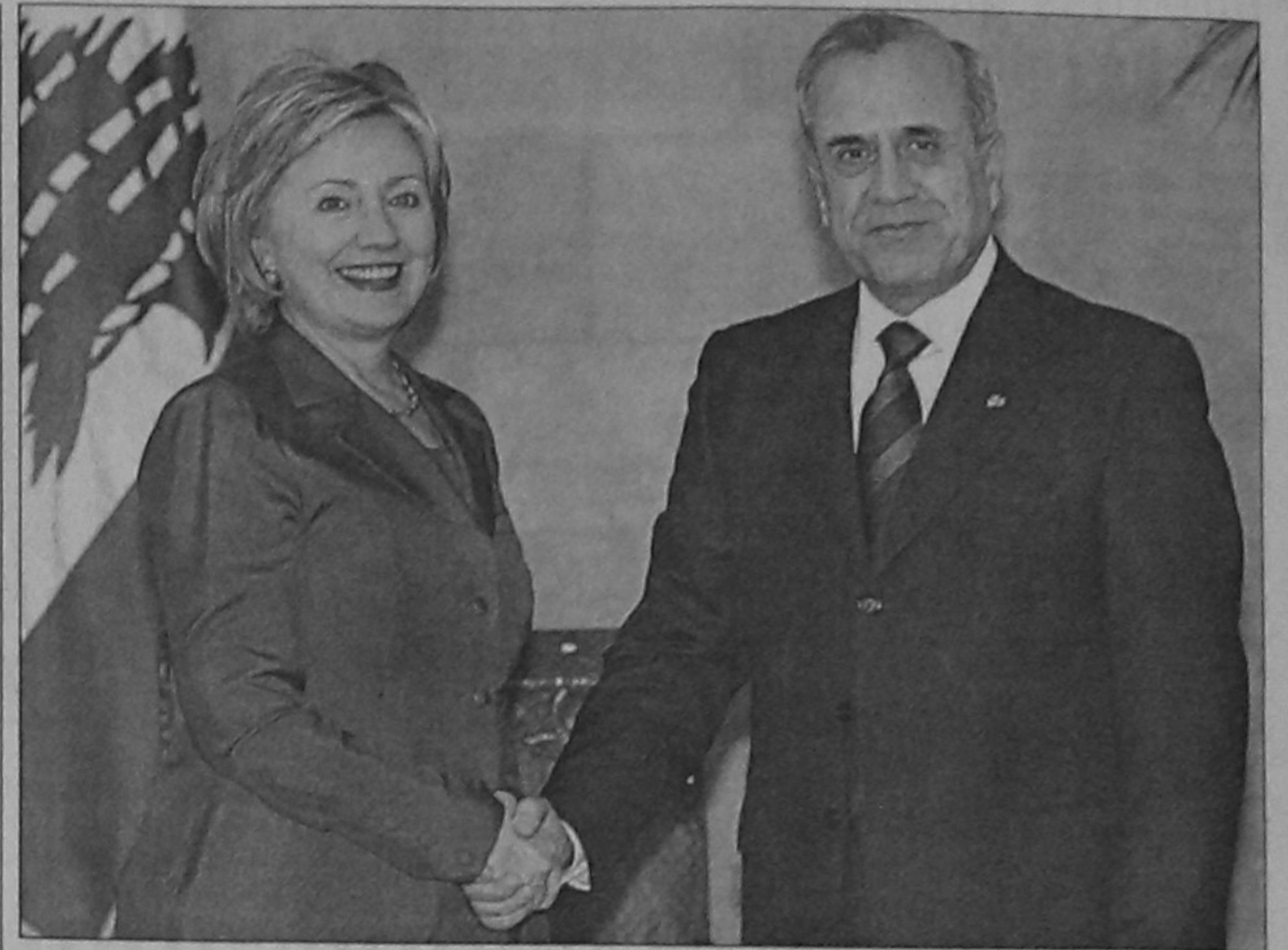
A handout picture released by the Lebanese photo agency Dalati and Nohra shows Lebanese President Michel Sleiman shaking hands with US Secretary of State Hillary Clinton during a meeting in Baabda, east of Beirut yesterday. Hillary made an unannounced visit to Lebanon as the country readies for parliamentary elections that could see the militant group Hezbollah and its allies emerge victorious.

Despite a fast start, eased by Democratic majorities in Congress and a demoralized Republican party, it is unclear whether Obama's political touch will endure on divisive issues like healthcare and climate change.