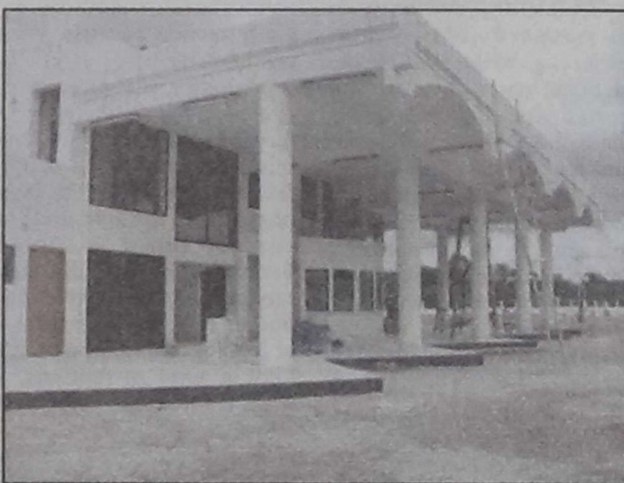
New building of Patuakhali central bus terminal, constructed at a cost of Tk 3.51 crore on three acres of land in the town's Kalikapur area, was opened yesterday.