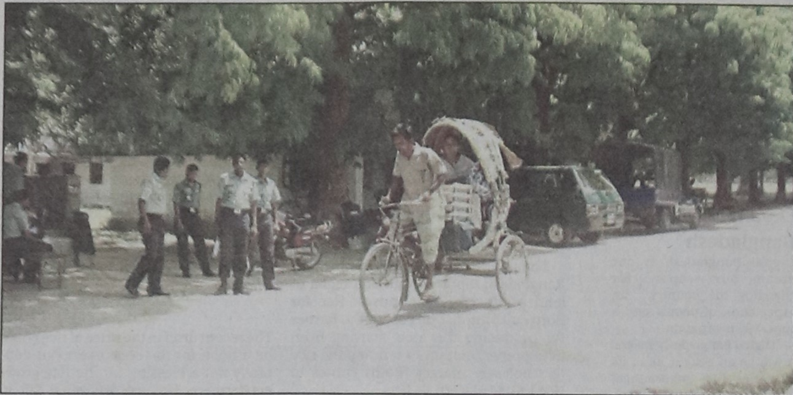
Students of Rajshahi University of Engineering and Technology returning to dormitories as they reopened amid tight security yesterday.

When contacted, RU vice-chancellor said the chairmen of all departments put forward a proposal at the meeting for reopening of the university and all dormitories. "The authorities will take a final decision in this regard after discussing the matter with other bodies concerned," he said.