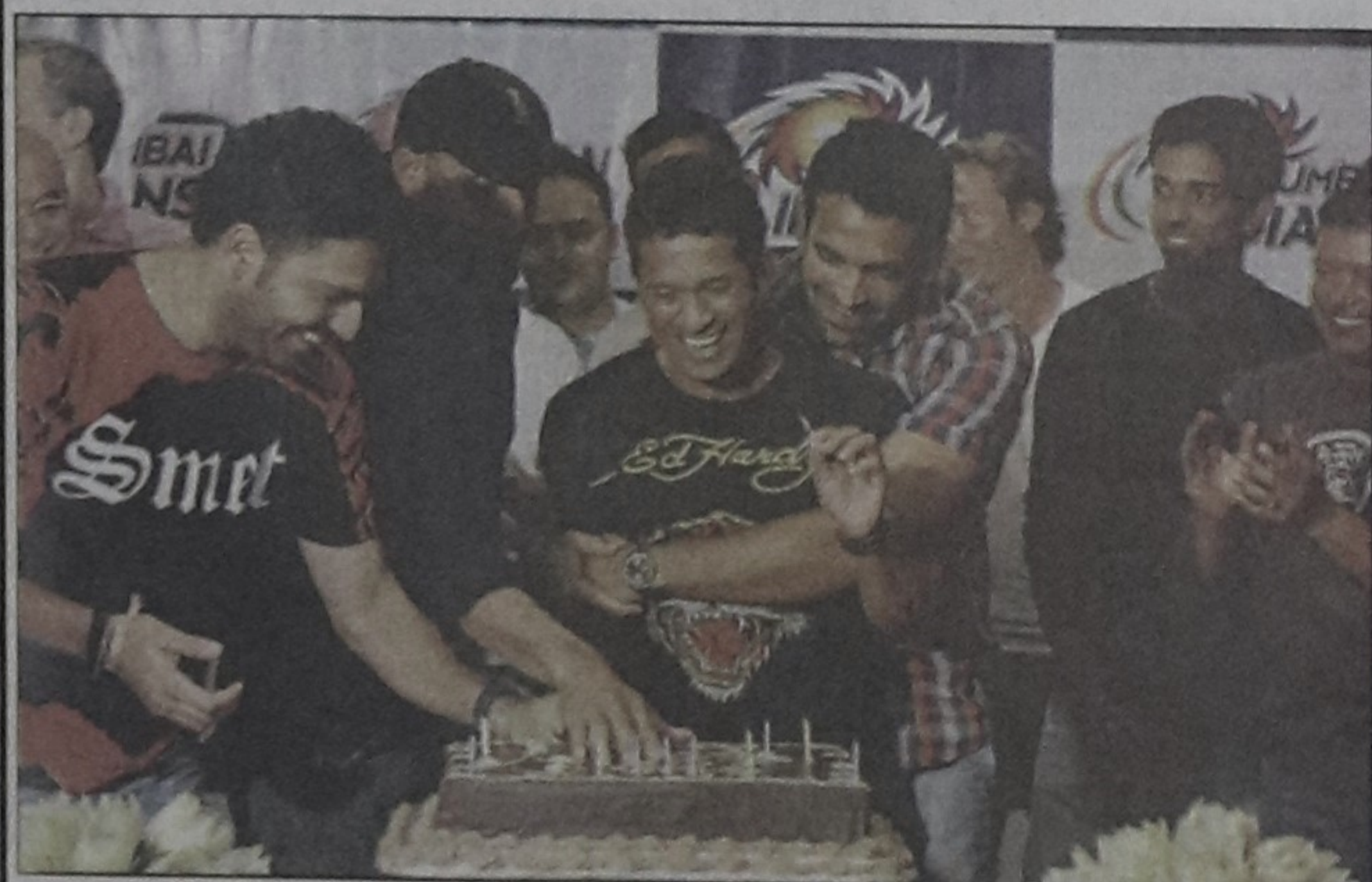
HAPPY BIRTHDAY: India superstar Sachin Tendulkar (C), who turned 36 yesterday, is about to cut the cake with his Mumbai Indians and India teammates at a party in Durban early Friday.