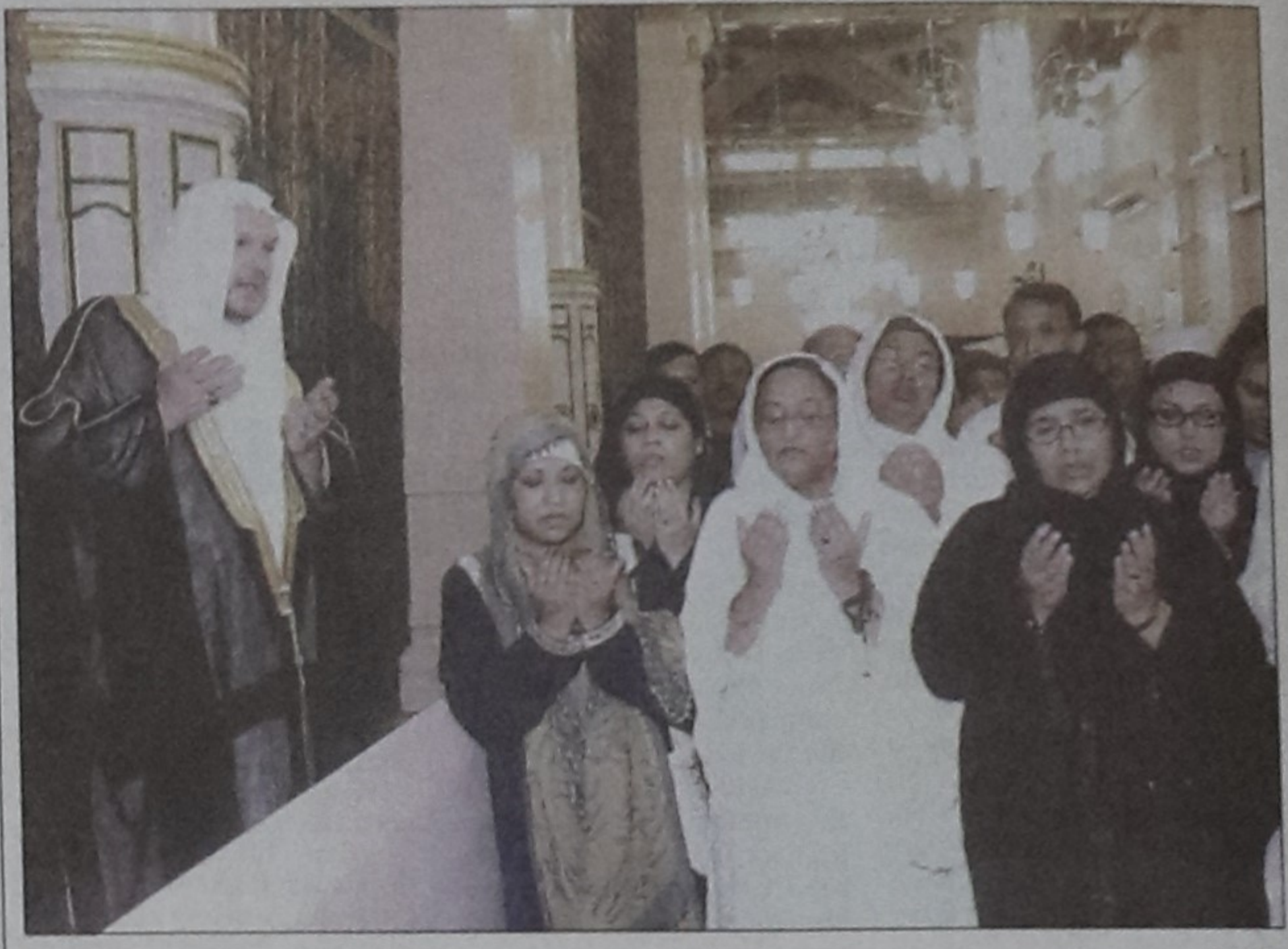
Prime Minister Sheikh Hasina offering special prayers at the Rawza Mubarak of Prophet Hazrat Mohammad (PBUH) in Madina.

Prime Minister Sheikh Hasina offered Juma prayers at Masjid-e-Nabawi in Madina yesterday. She also visited the Rawza Mubarak of Prophet Mohammad (PBUH) where she prayed for peace, progress and prosperity of the country as well as the Muslim Ummah. After offering Juma prayers, Sheikh Hasina left for Jeddah by a Saudi Royal aircraft.