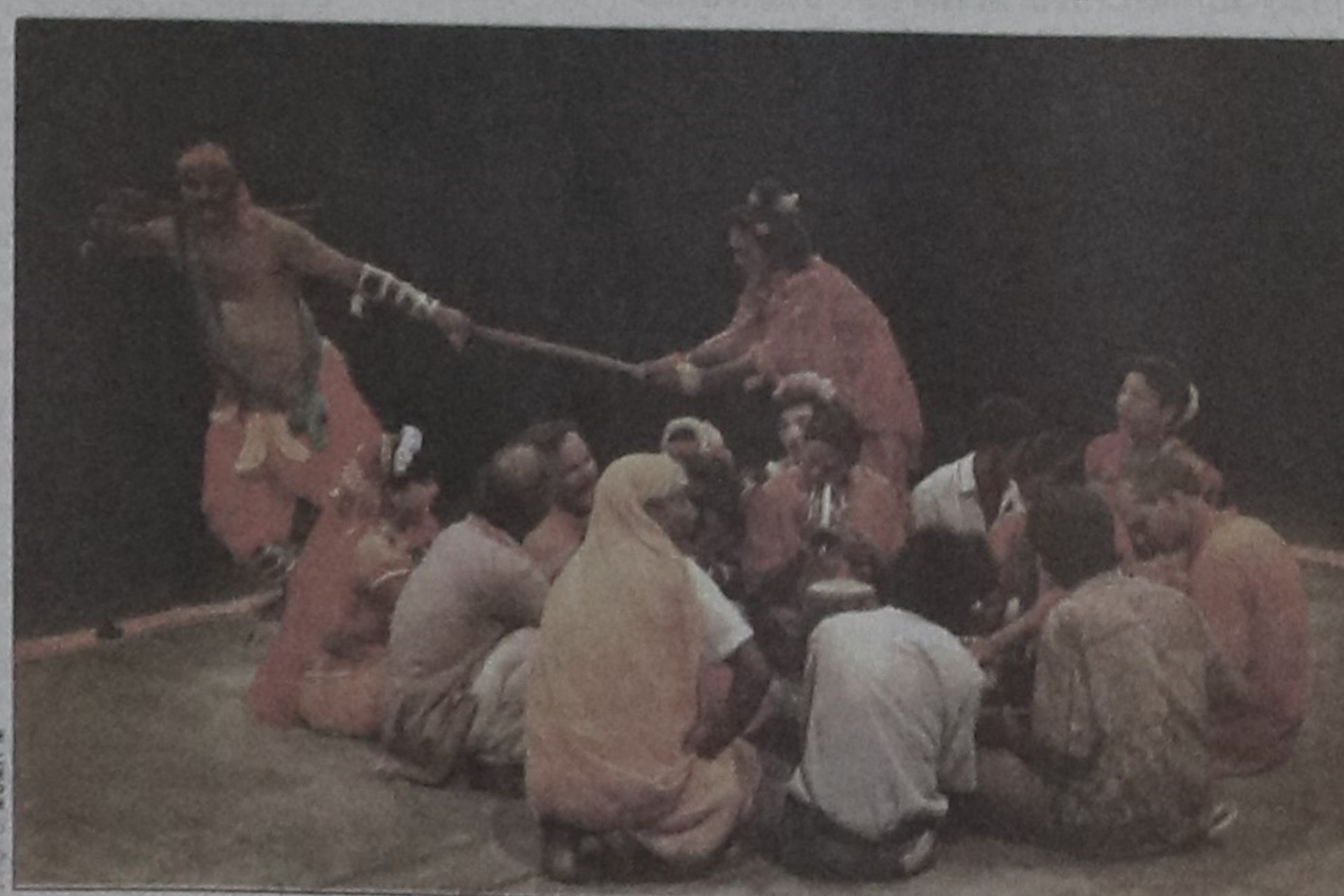
Performers of Sundarganj Palagaan-er Akhra in the pala "Gujra Satir Banobash."