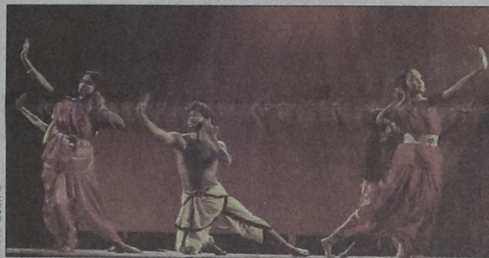
Around 1000 dancers, from all over Bangladesh, are taking part in this year's festival.

that wishes it could move like its star, and to the mother who says, 'you already can.' This day is dedicated to every body of every creed, colour and culture that carries the traditions of its past into stories of the present and