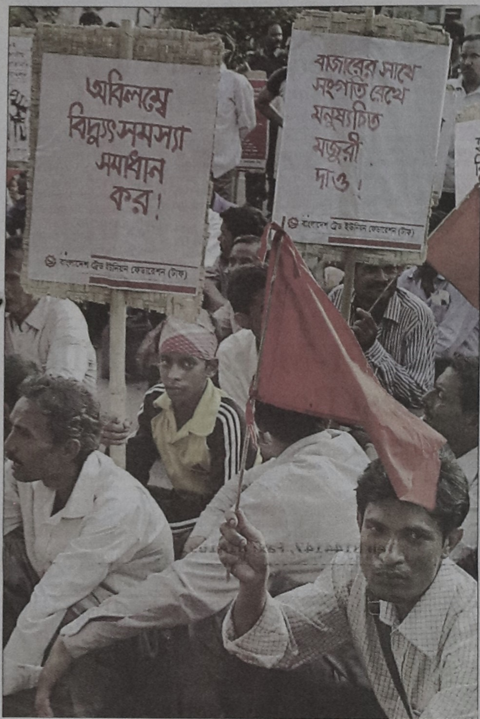
Trade Union Federation demonstrates at Muktangan in the city yesterday demanding an end to water and power crisis.