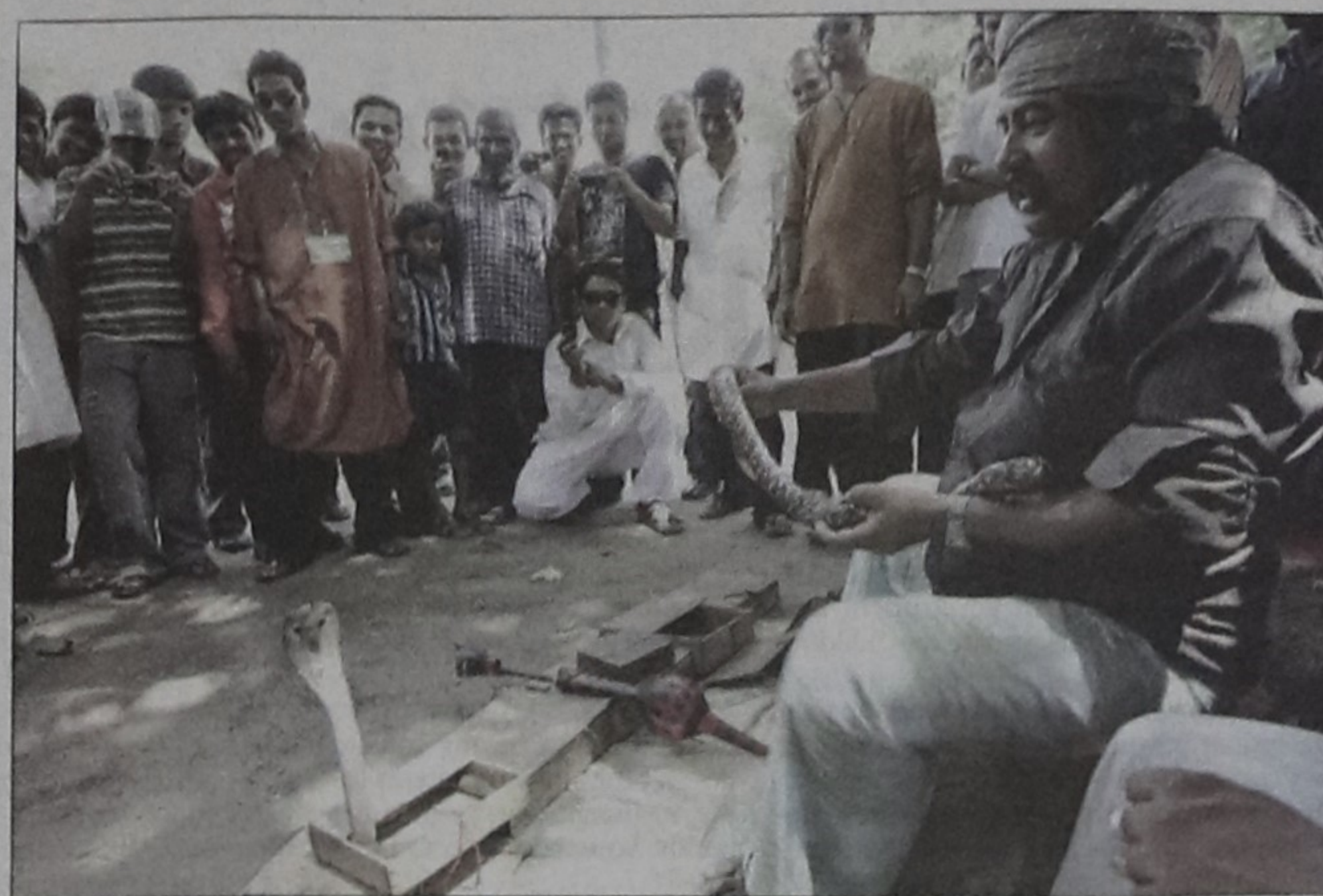
A snake charmer entertains people during the Baishakhi Festival organised by the Cultural Club of United International University (UIU) on Residential Model College premises in the city yesterday.

Gas produced through these plants is used for cooking and lighting in rural households. The slurry of biogas plants, being a very good organic fertiliser, is used to maintain soil fertility and increase crop production apart from being fish feed.