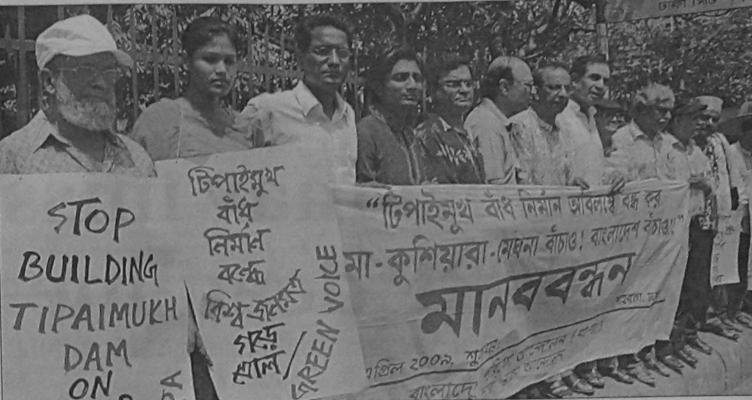
Bangladesh Paribesh Andolon (Bapa) and Jatiya Nadi Raksha Andolon form a human chain in front of National Museum in the city yesterday protesting the construction of Tipaimukh Dam.

Relatives, friends and well-wishers are requested to attend the qulkhwani and pray for salvation of the departed soul.