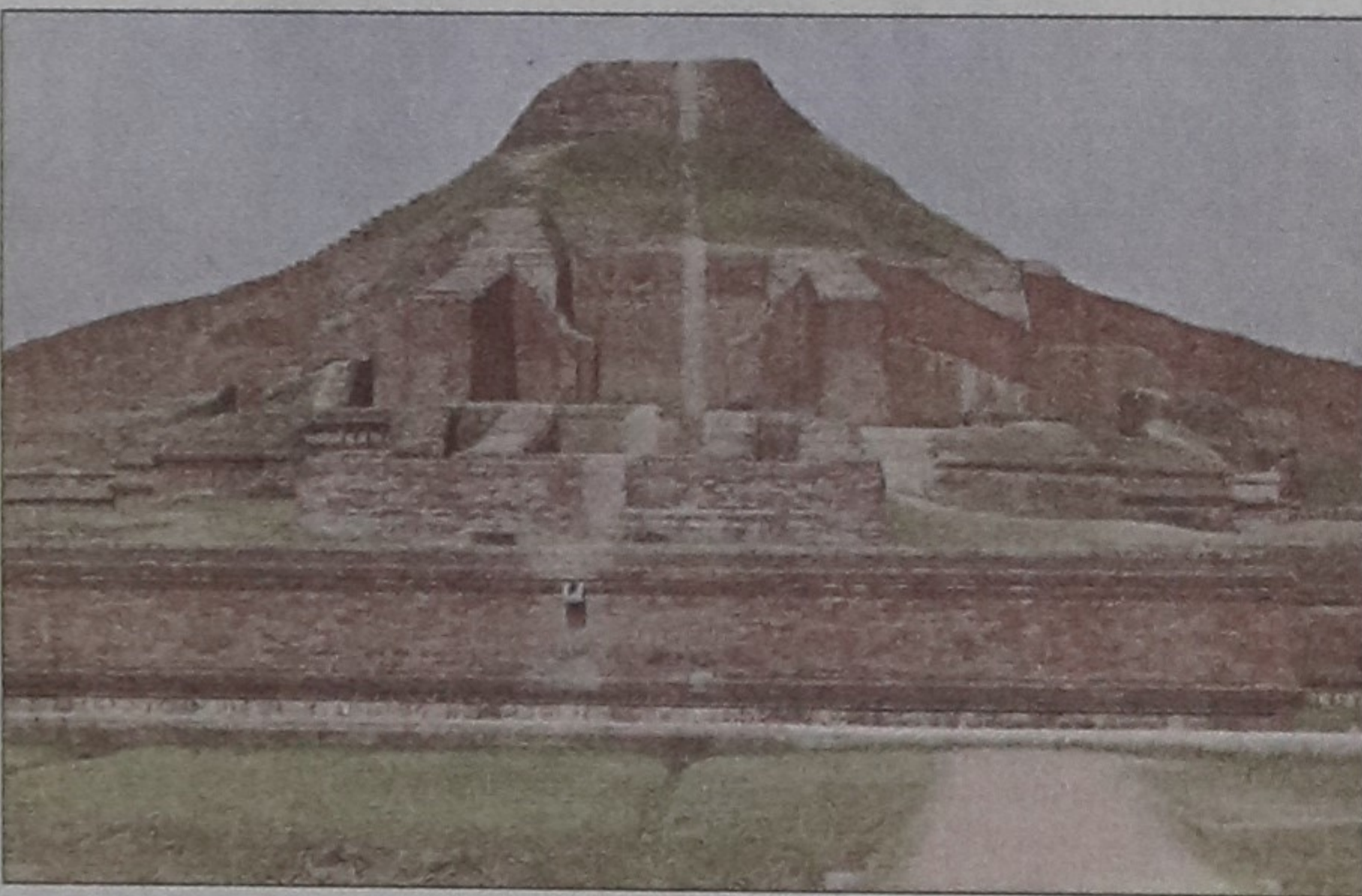
The priceless terracotta, top left, of Paharpur monastery in Naogaon is covered with spider webs. Sheer negligence causes moss, top right, to grow on a number of terracotta plaques. The monastery in Paharpur.

Govt won't go for strict control of market: Faruk