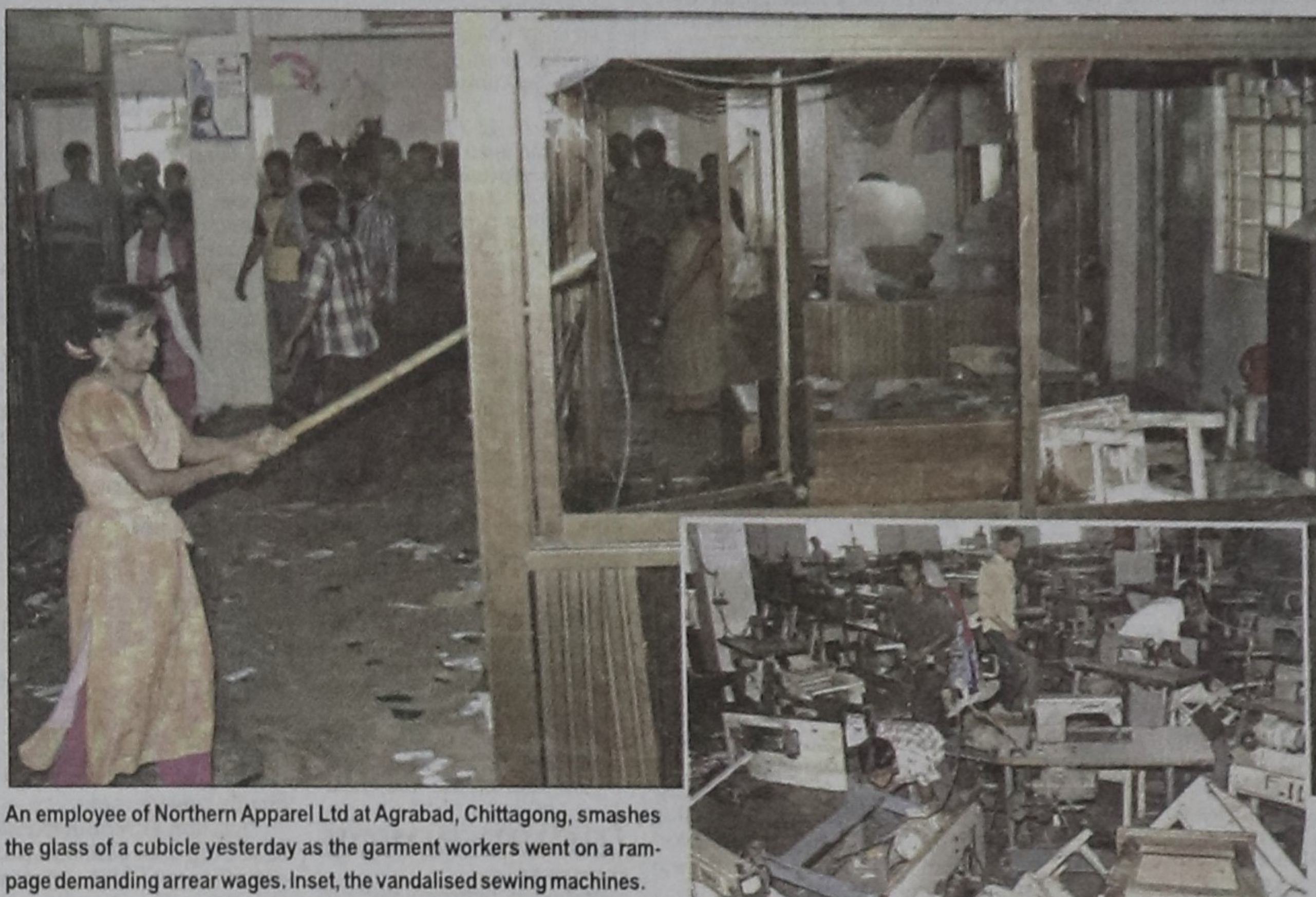
An employee of Northern Apparel Ltd at Agrabad, Chittagong, smashes the glass of a cubicle yesterday as the garment workers went on a rampage demanding arrear wages. Inset, the vandalised sewing machines.