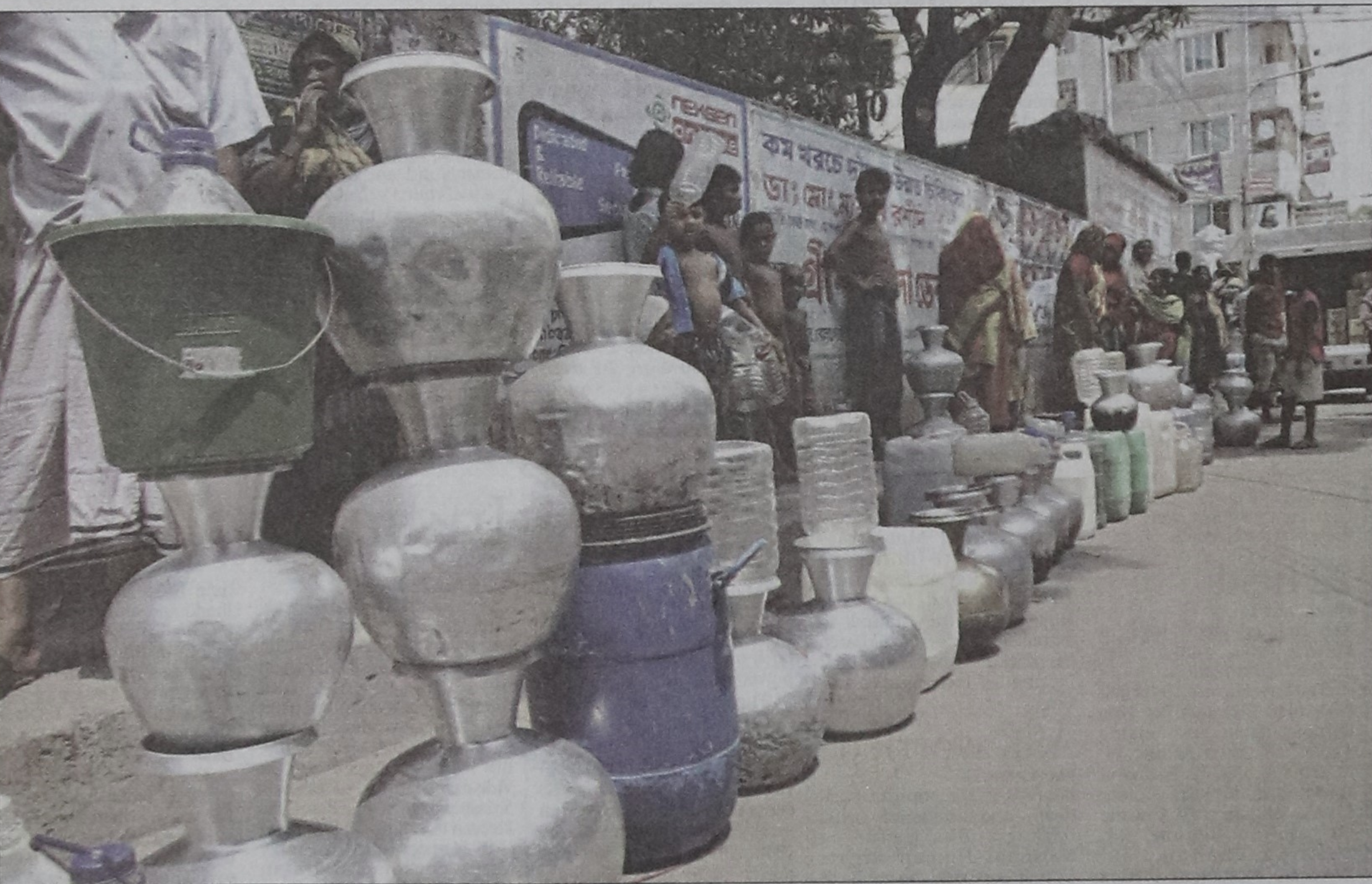
People of Moghbazar Wireless Railgate area yesterday queue up their water vessels and wait for the Wasa tanker to arrive as they are suffering from acute water supply shortage.