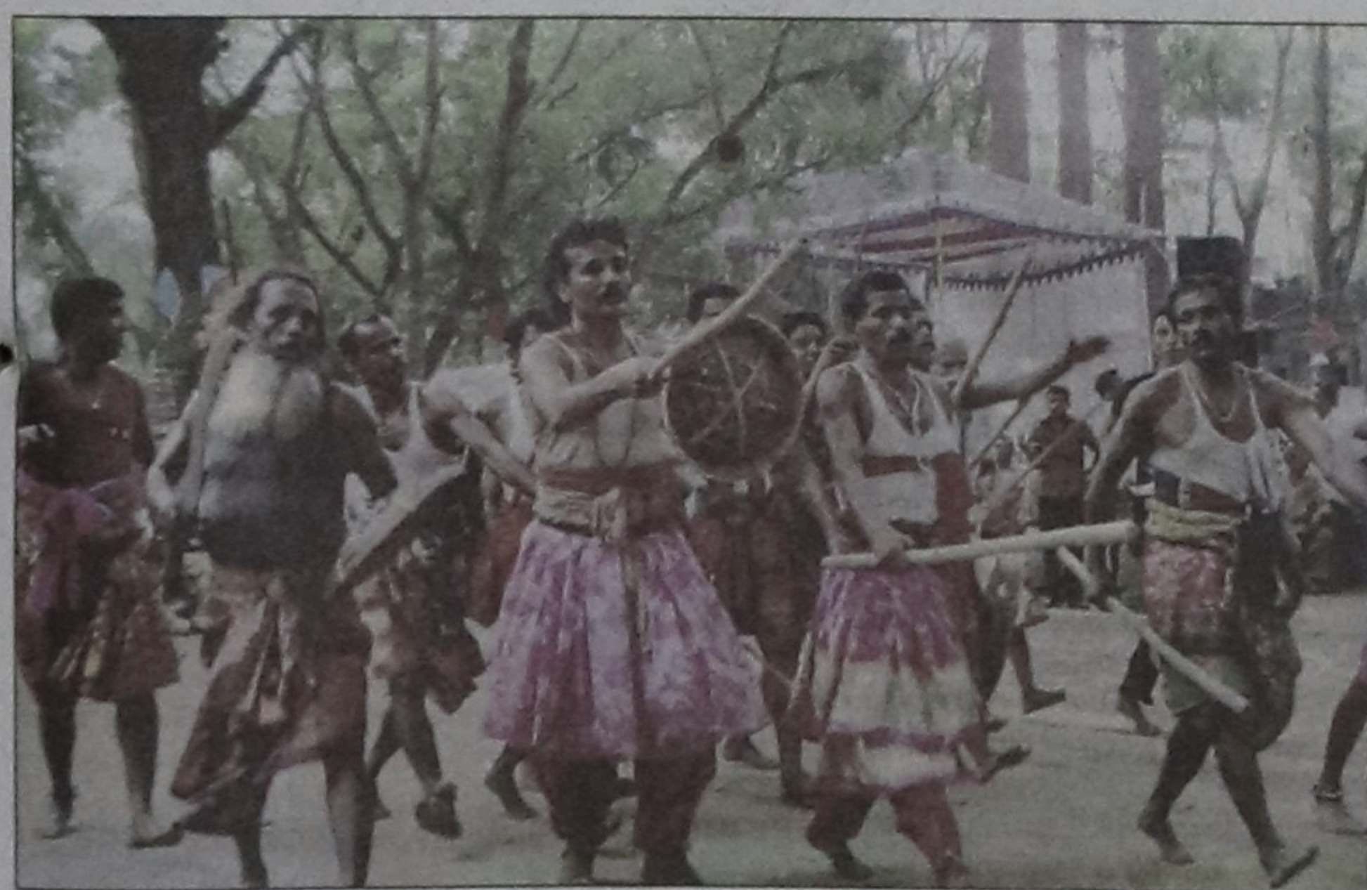
Highlights of the festival are traditional rural sports like 'lathi khela.'

Five-day traditional fest inaugurated in Tangail