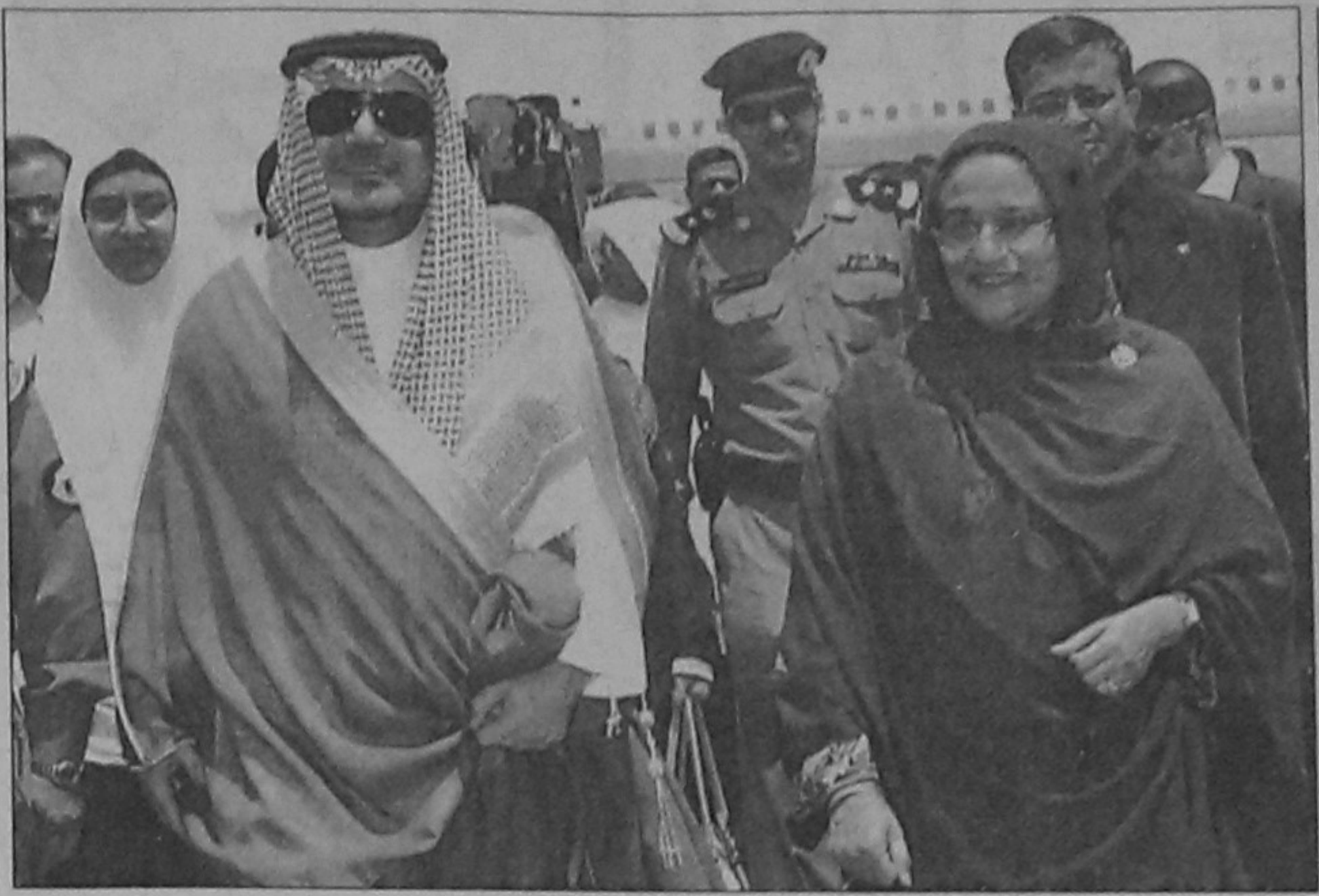
Prince Abdul Aziz Bin Majed, the governor of Madina, receives Prime Minister Sheikh Hasina on her arrival at Prince Mohammad Airport in Madina from Makkah yesterday.

They demanded an allocation of Tk 6 crore for collecting complete data on the people with disabilities, Tk 10 crore for the 'Special Education Demand Development Project', Tk 6 crore for awareness programme among the health professionals, Tk 18 crore for disability prevention centre project, Tk 10 crore for special teachers, Tk 9 crore for stipend programme for students with disabilities, Tk 37.5 crore in allowance for the poor disabled group, Tk 10 crore for the rehabilitation of the acid-burnt victims and physically challenged people, Tk 1 crore for national level sports competition and Tk 80 lakh for cultural activities.