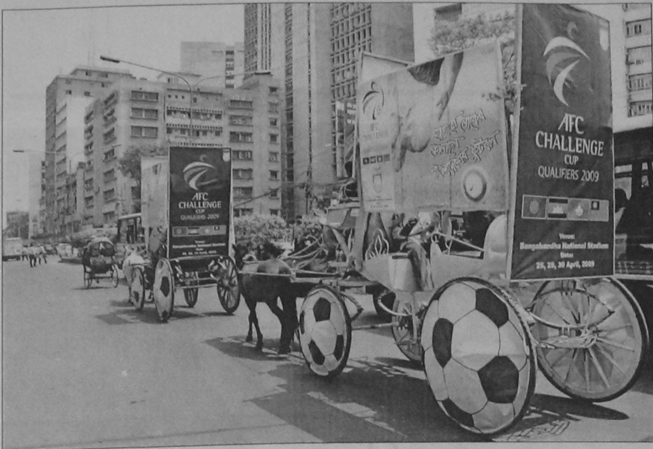
Horse driven carriages are being used to promote the upcoming Asian Football Confederation (AFC) Cup in the capital yesterday. Myanmar, Macao, Cambodia along with hosts Bangladesh will take part in the tournament starting April 26.