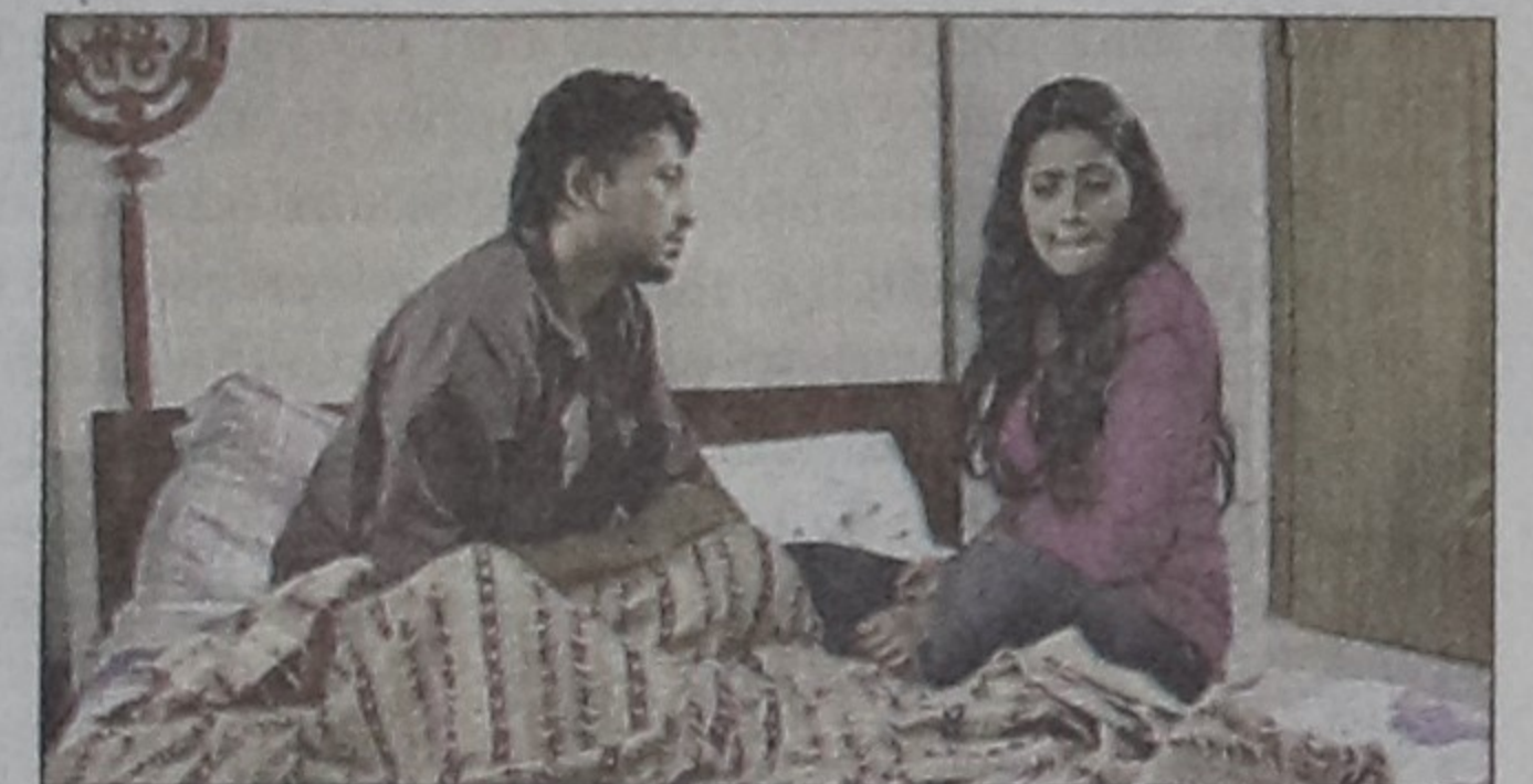
A scene from the serial.