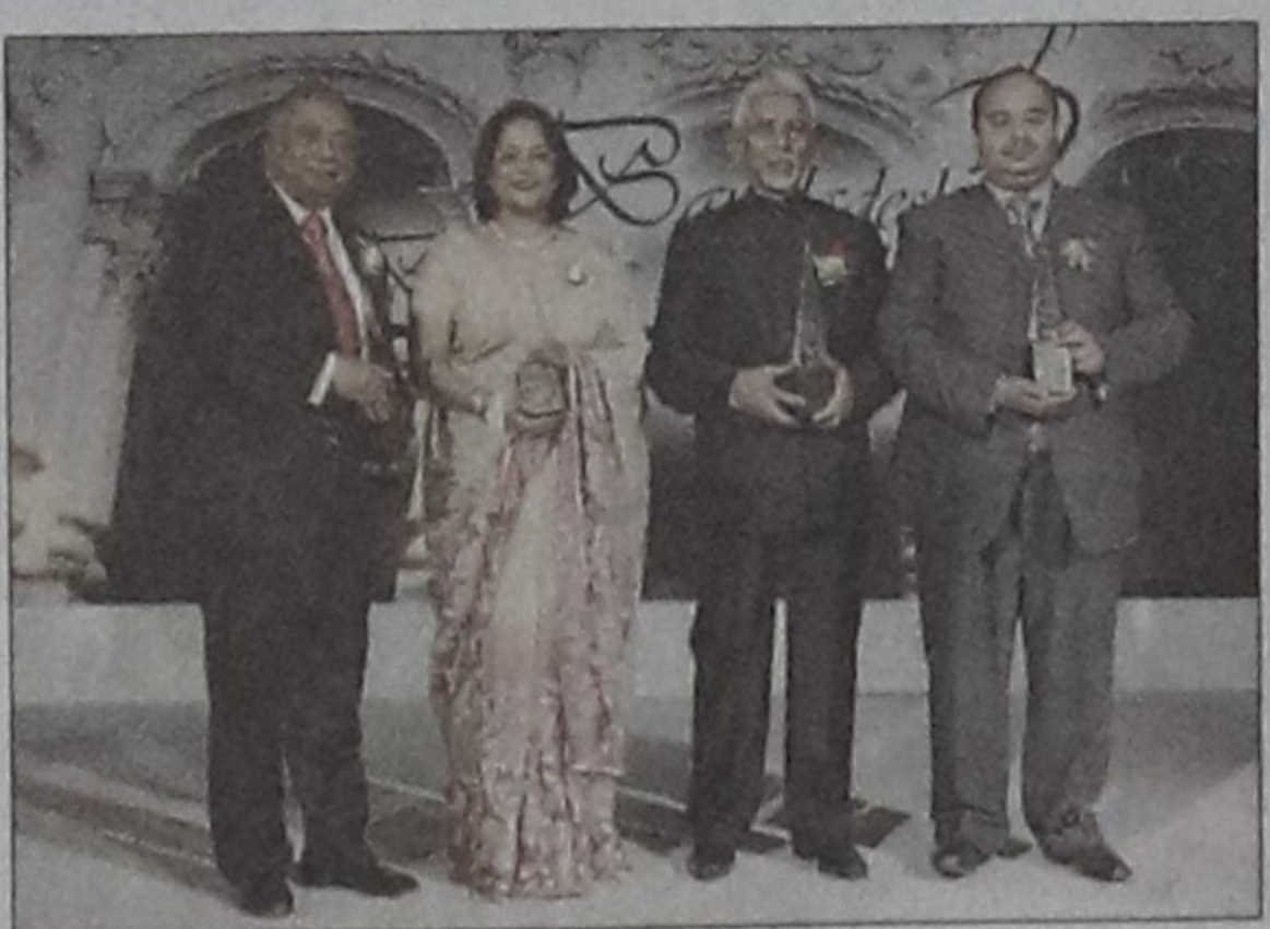
Bangladesh Business Awards 2008 On April 24 at 11:25 pm, on Channel i Awarding Excellence in Business Jointly organised by The Daily Star and DHL Express