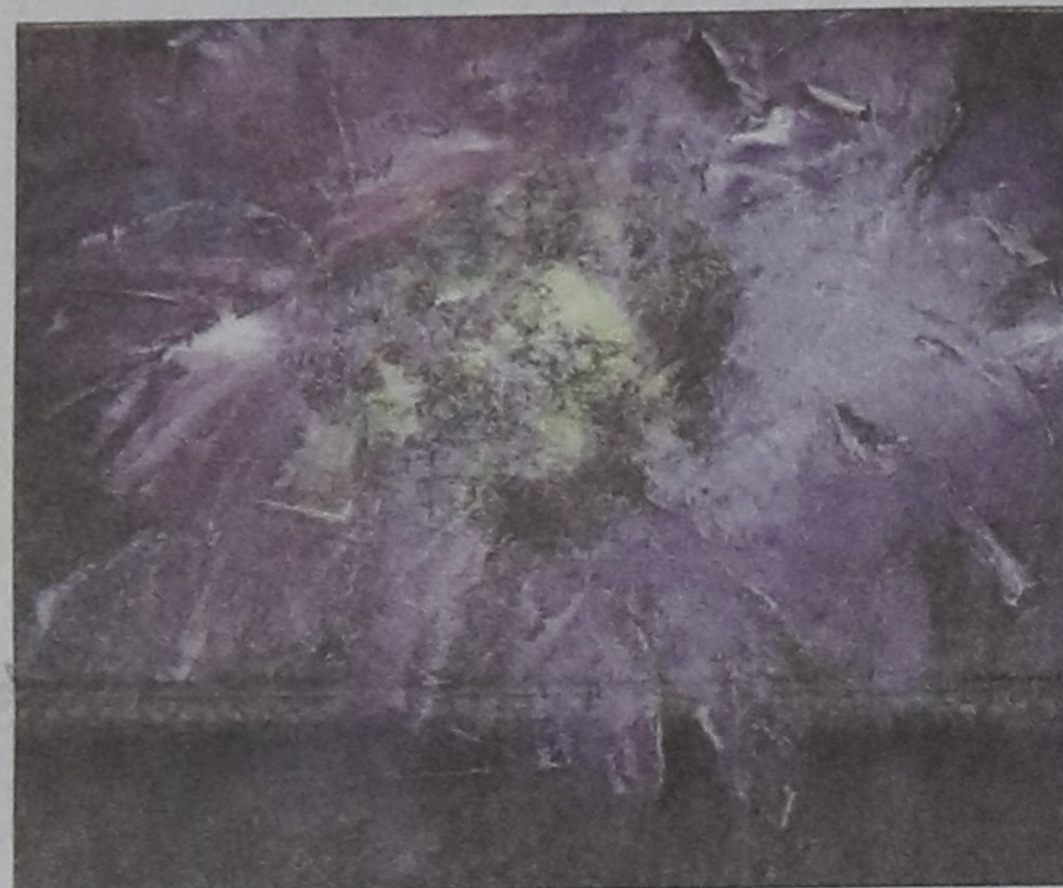
Calligraphy and floral motif by Nazlee.