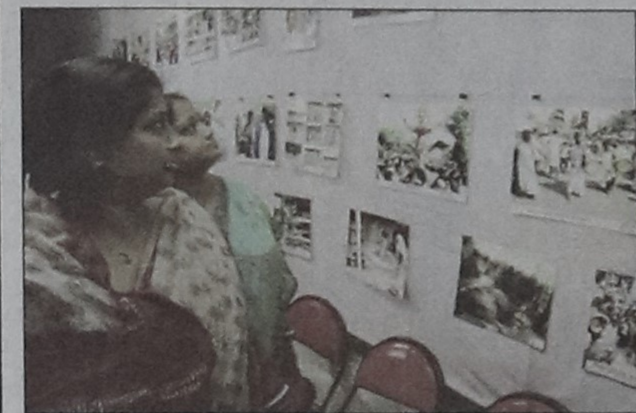
Visitors at the exhibition.