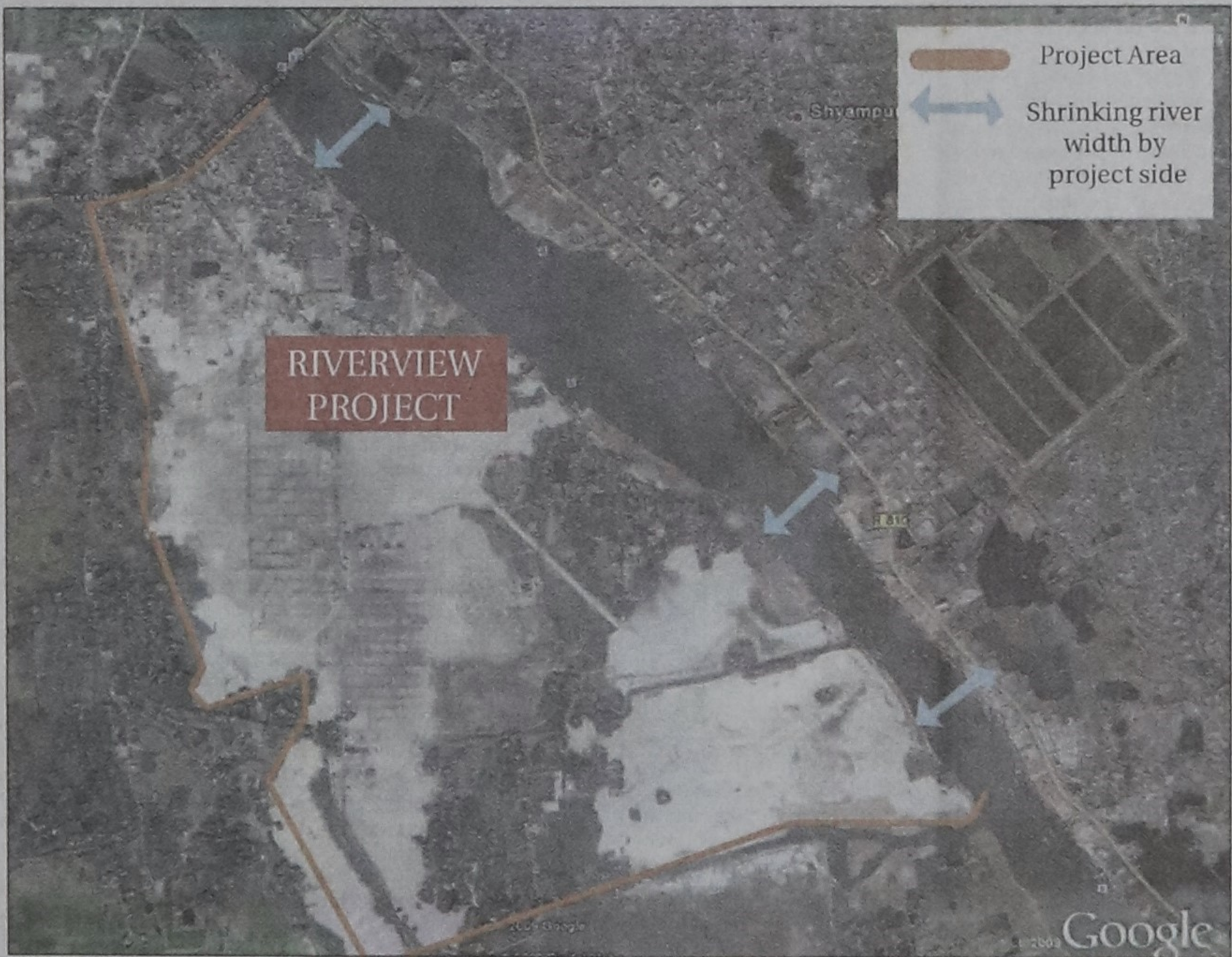
Satellite image of Bashundhara Group's Riverview Project where the Group's Chief Ahmed Akbar Sobhan promised to build a stadium for Bangladesh Football Federation. The land, part of protected wetlands and flood flow zones, cannot be legally used for building any structure. More photo on page-15