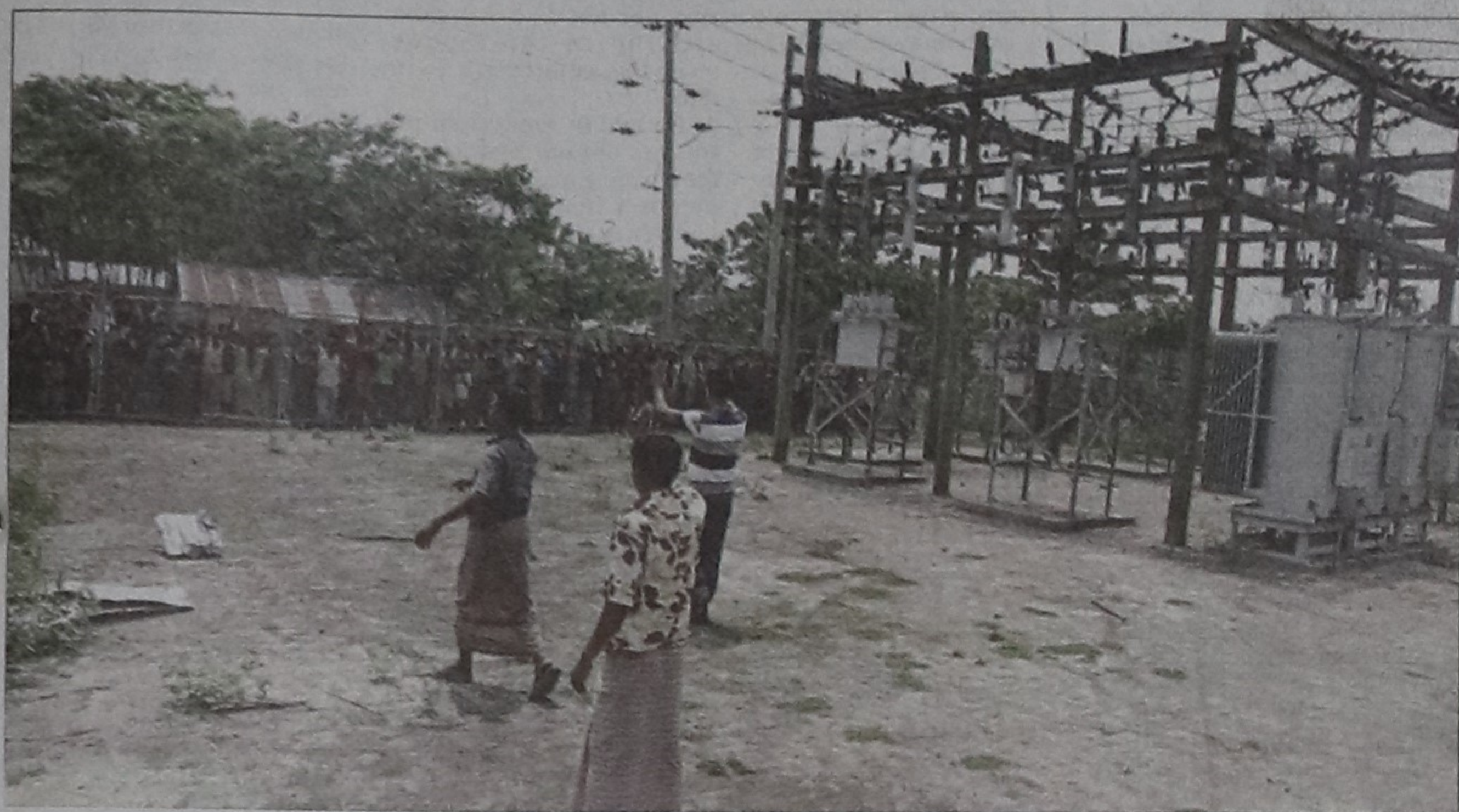
Agitated by frequent power cuts, people of Jalakandi in Arahazur upazila of Narayanganj attack a power distribution sub-station yesterday.