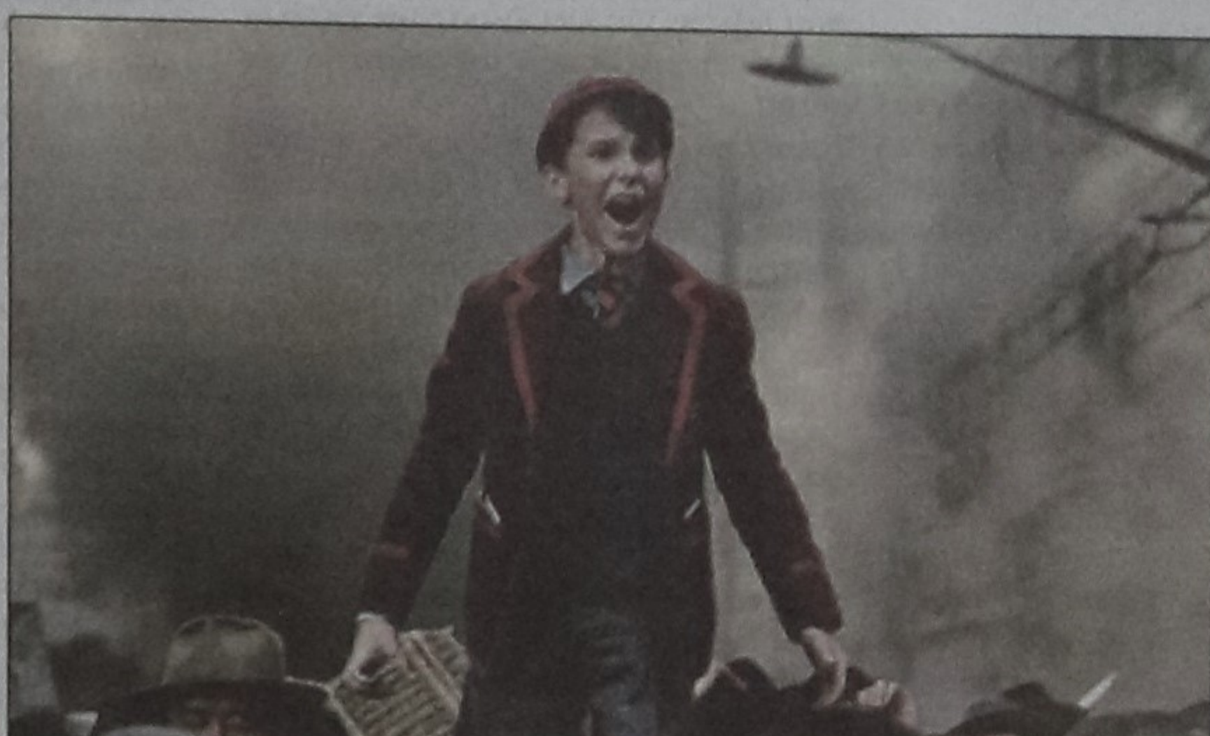
Christian Bale stars in Steven Spielberg's film of JG Ballard's novel, Empire of the Sun.