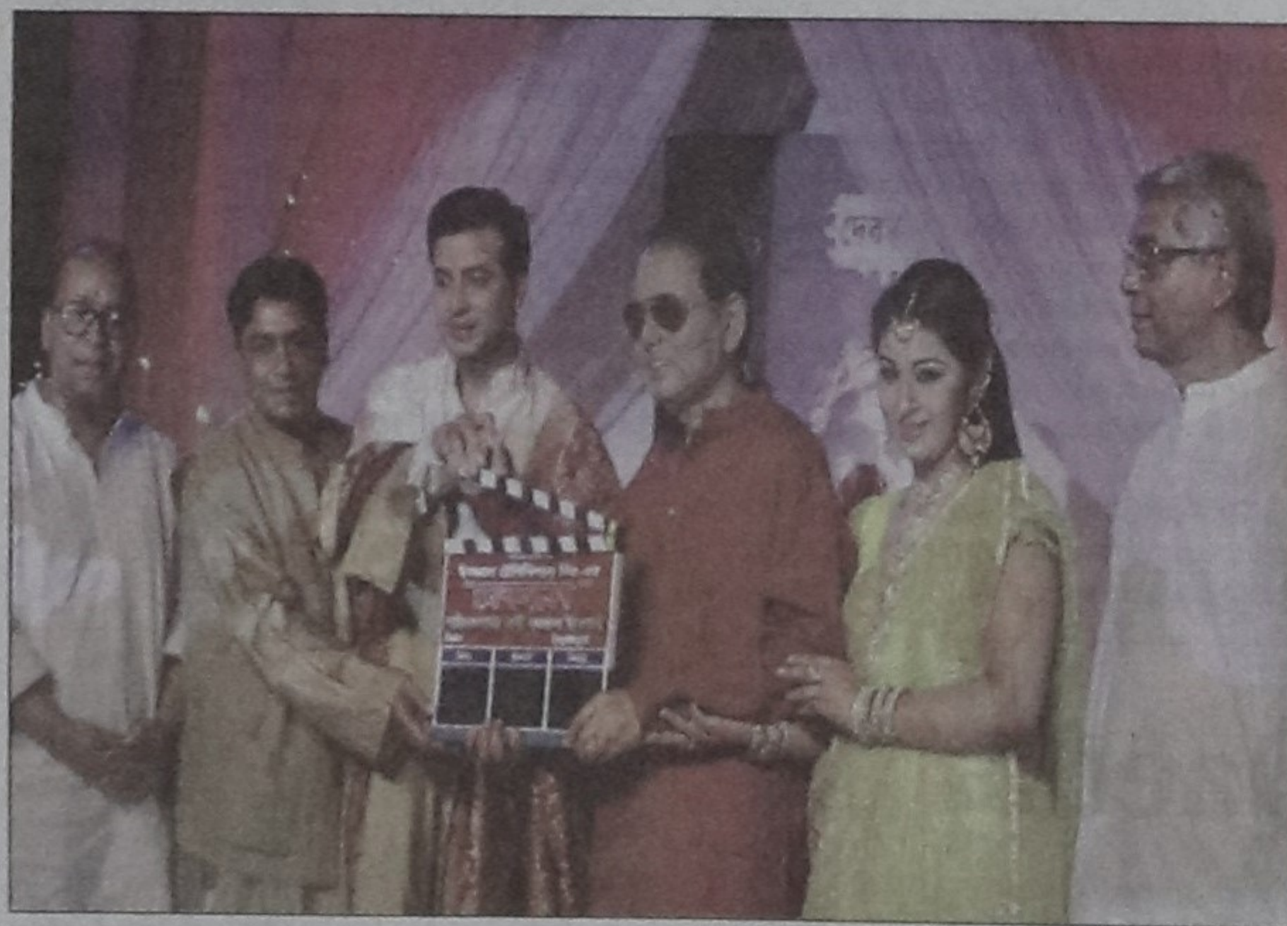
Dignitaries and actors at Mahurat of Devdas.