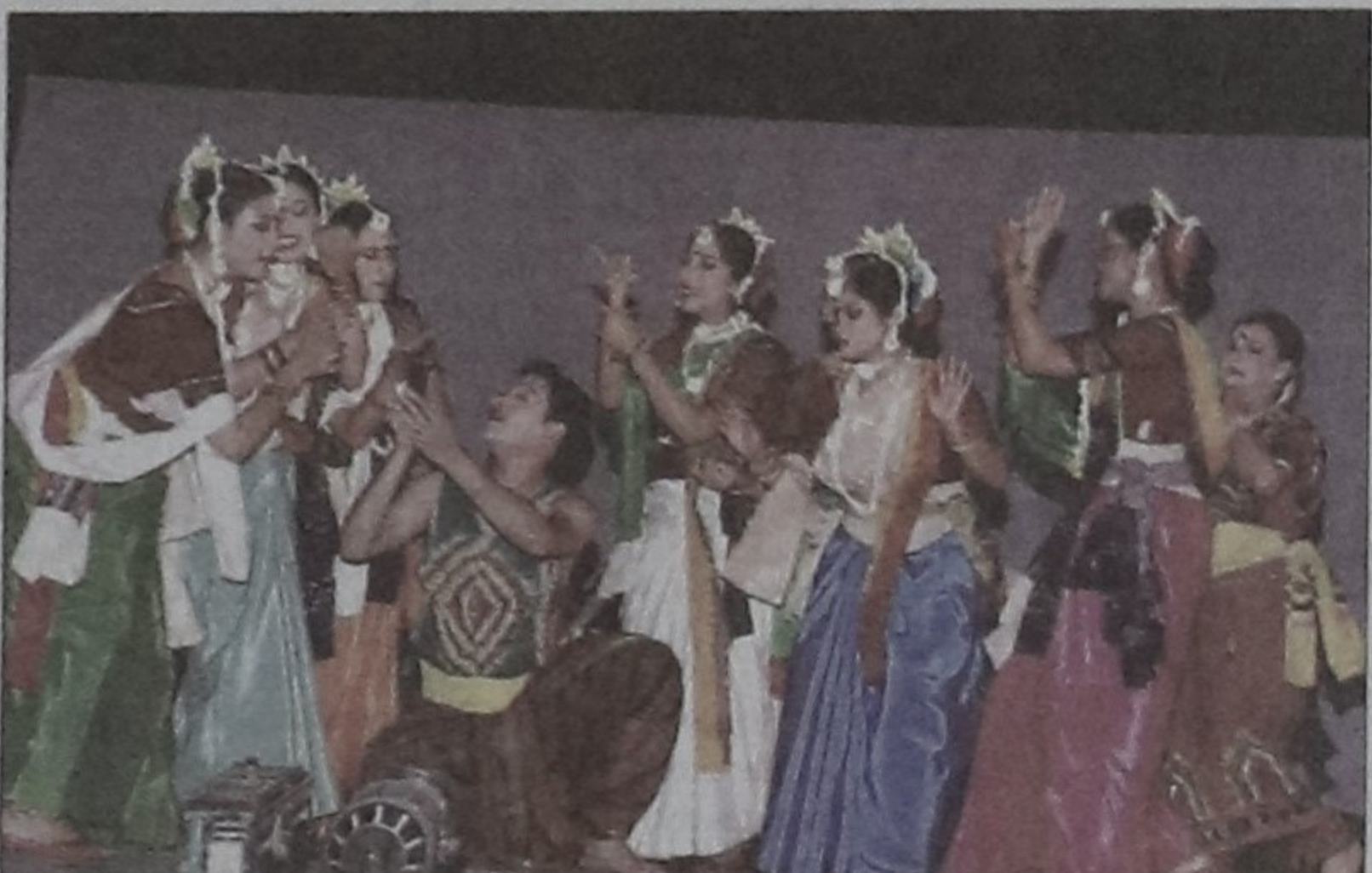
Dancers of Nriyannadan perform 'Chandalika.'

sung, composed and written by mystic poets. Among those that went down well with the audience were 'Khachar bhoir achin pakhi' of Lalon Shah, 'Ki shap-e kamraro' of the famous late singer, lyricist and composer Kabi Bijoy Sarkar and 'Aamar bondhu doyamoy' (Radharaman, also