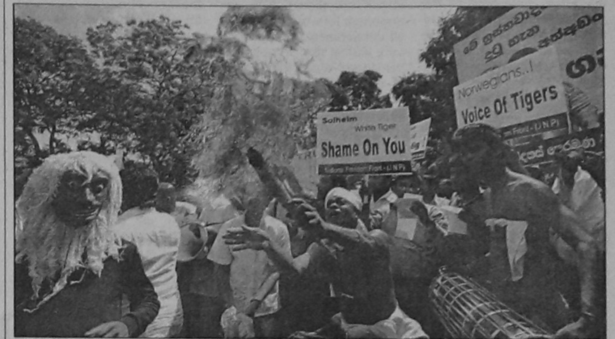
Sri Lankan demonstrators march in protest towards the Norwegian embassy in Colombo yesterday. Demonstrators, led by the all Buddhist party, the JHU, demanded that Colombo shut down the embassy following the government's decision to dismiss Oslo as a peace broker.

"All the Taliban are the same and there should be no distinction between good and bad Taliban and it was need of the hour that government tackles them with an iron hand", said another source.