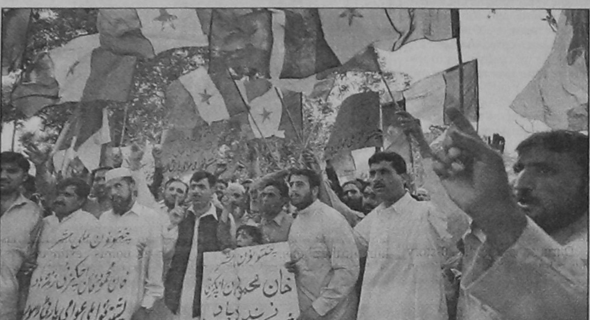
Pakistani activists of Pakhtun-khwa Milli Awami Party march during a peace rally in Lahore on Sunday. The protesters staged the peace rally for rights of Pakhtun-Khwa who are living in Punjab province.