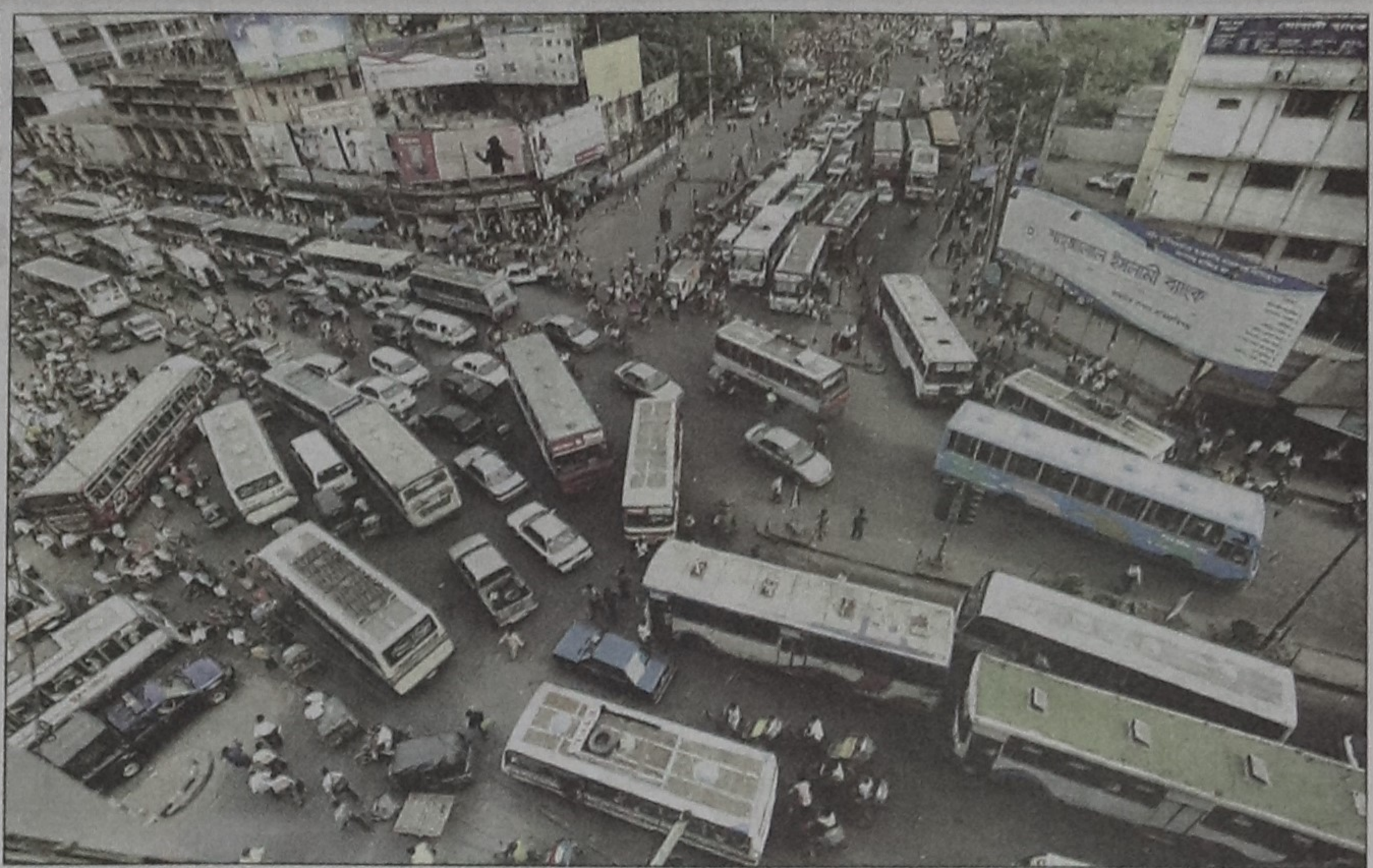
Jatiya Sramik League, labour front of ruling Awami League, holds a rally at Muktangan in the city yesterday, causing a gridlock in the Paltan area.

CAMPE also demanded the developed countries and international organisations spend $16 billion for achieving the EFA target and billion dollars for adult literacy.