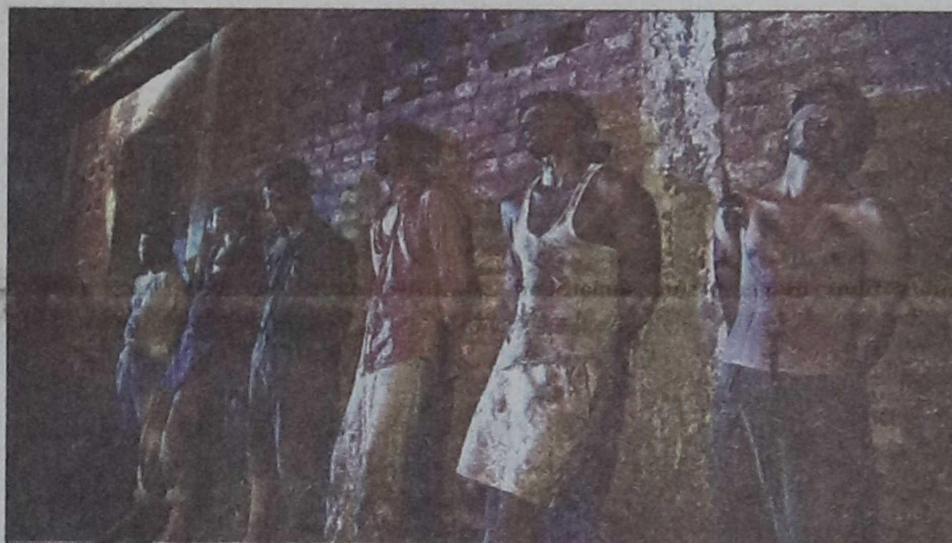
A production still from "Deep Nevar Ag-E"

the standoff to end. It was my brother's birthday and obviously the plan to celebrate with friends and relatives was cancelled but we did cut a small cake at home and shared it. And that's my point; even in the harshest of times we experience fleeting moments of joy. I wanted to make a movie on the Liberation War that'd break free from the usual one-dimensional mode."