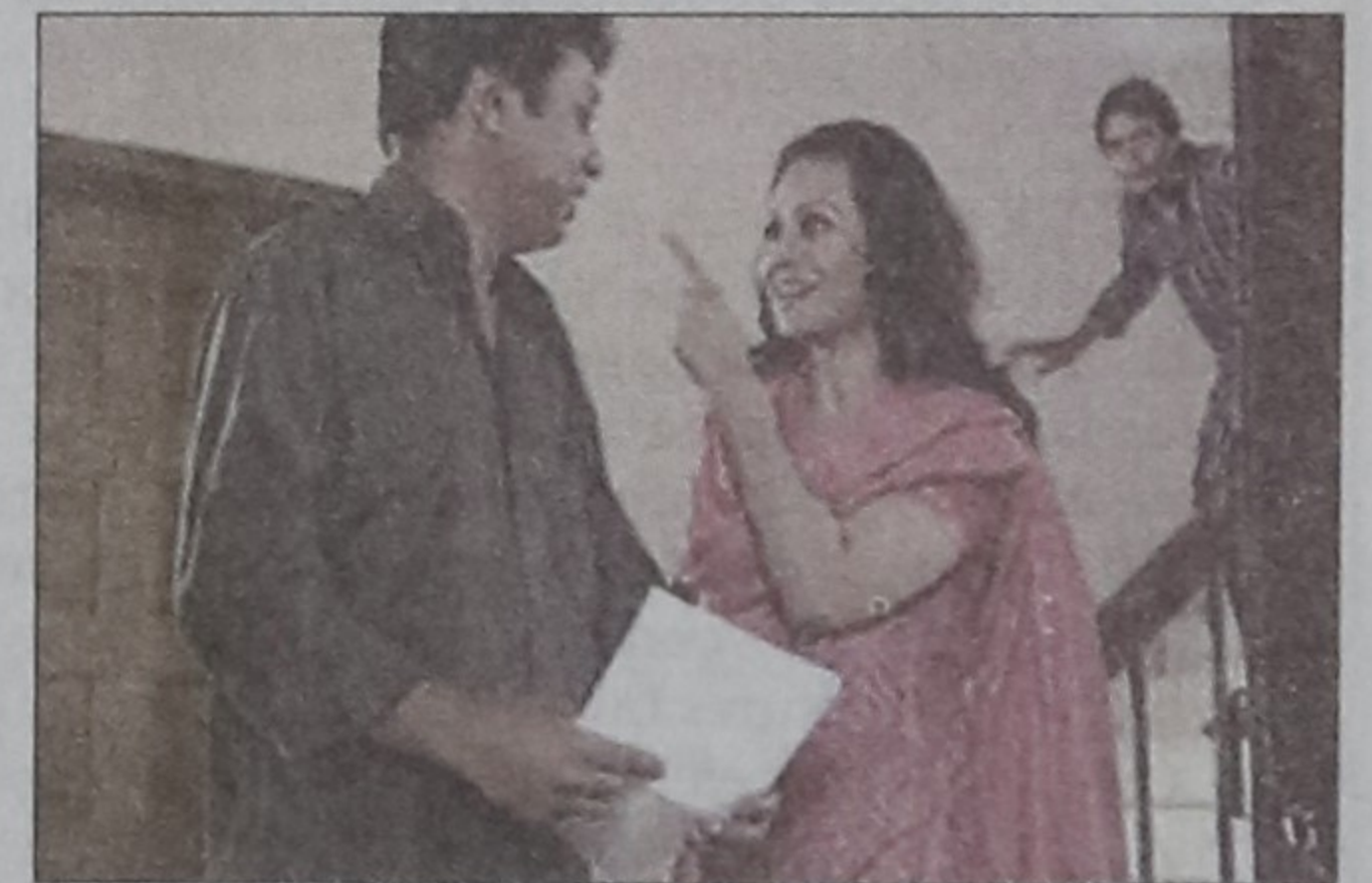
A scene from the play

The serial presents the story of six men, coming from different districts and sharing a flat in the city. They are nothing alike, yet there is a similarity. They are all scared of ghosts. Their landlord lives upstairs with his wife and two daughters. One day a man named Rafique comes to live with the six tenants. It helps the panicked men to deal with