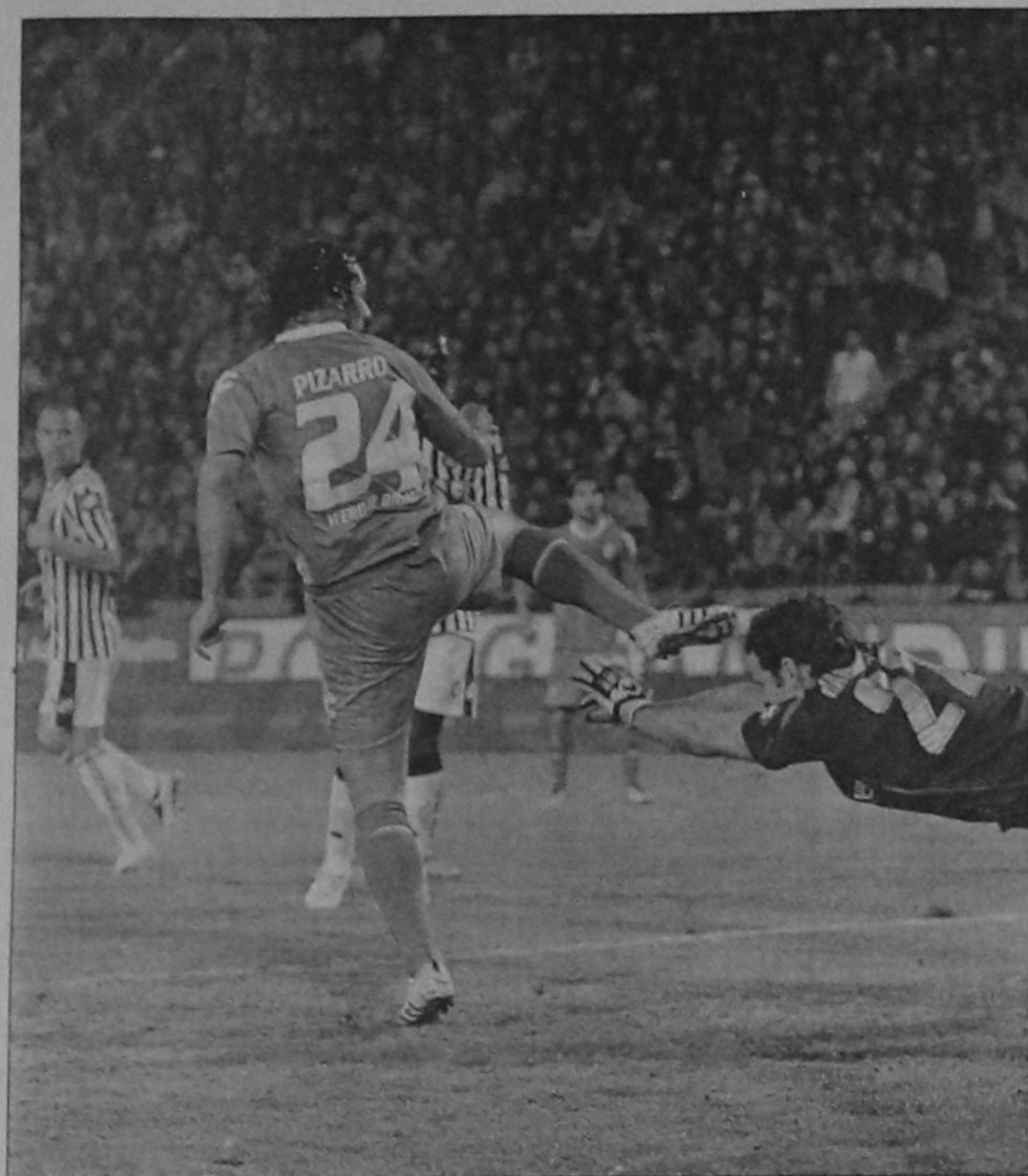
Werder Bremen striker Claudio Pizarro (L) scores from a flick against Udinese during their UEFA Cup quarterfinal in Udine on Thursday. The match ended in a 3-3 draw with Werder Bremen qualifying for the semifinals.