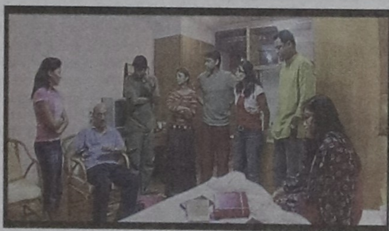
A scene from "Jogphol"

The plot: A professor of a private university plans to go to Bangkok with his colleague and some of their favourite students. Mysterious incidents start to unravel as the group lands in Bangkok. Even at the hotel, the tourists experience some eerie presence. The group is attacked by a faceless entity. Feeling helpless, the group approaches a Bengali law