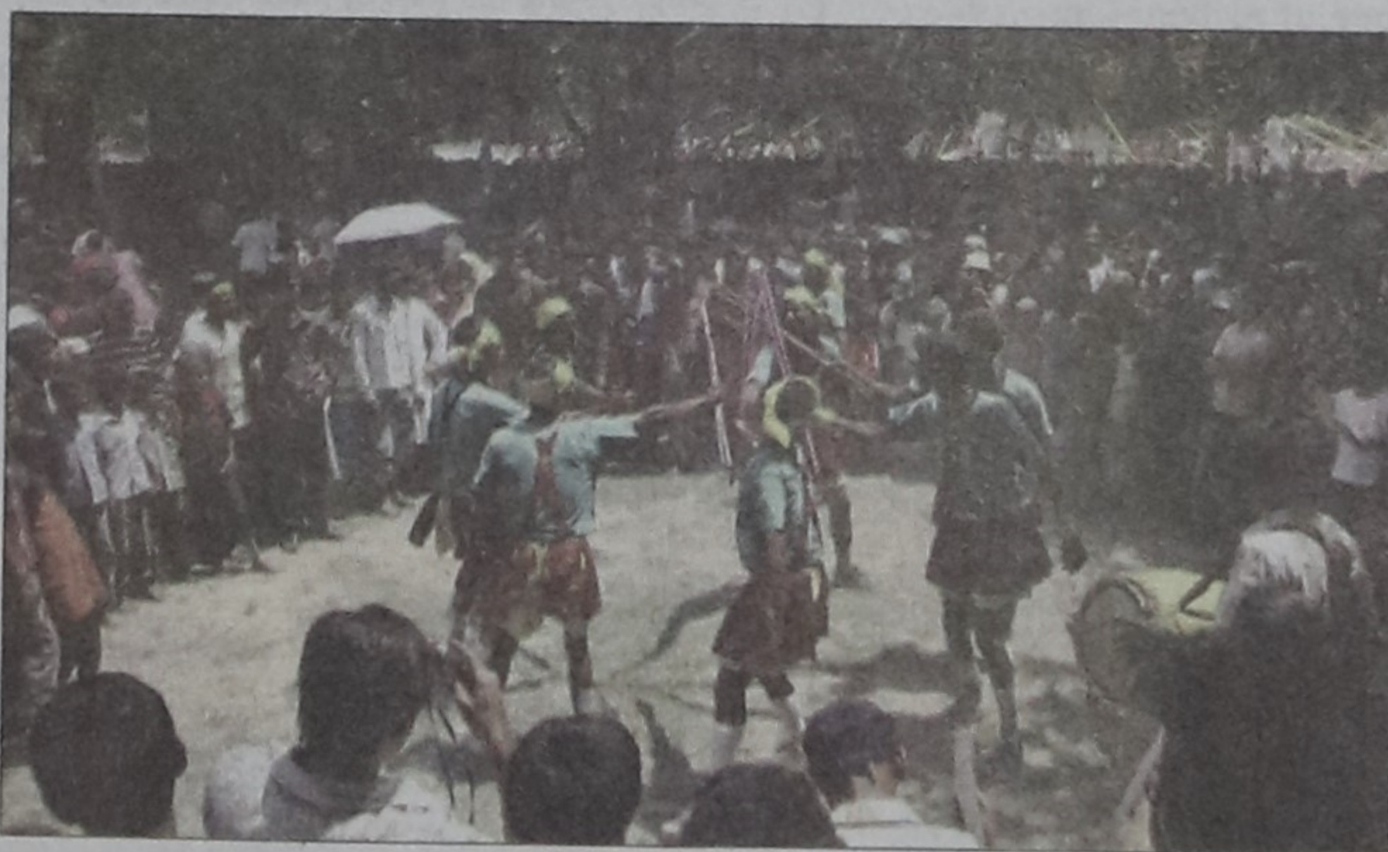
Highlights of the celebration were 'lathi khela,' bullfight, snake charmers and more.

Since early morning on 'Pahela Baishakh' (April 14) the campus buzzed with the presence of thousands, breaking the eight-year stint of cultural barrenness. The past situation forced the students to celebrate events like 'Pahela Baishakh' at different venues in