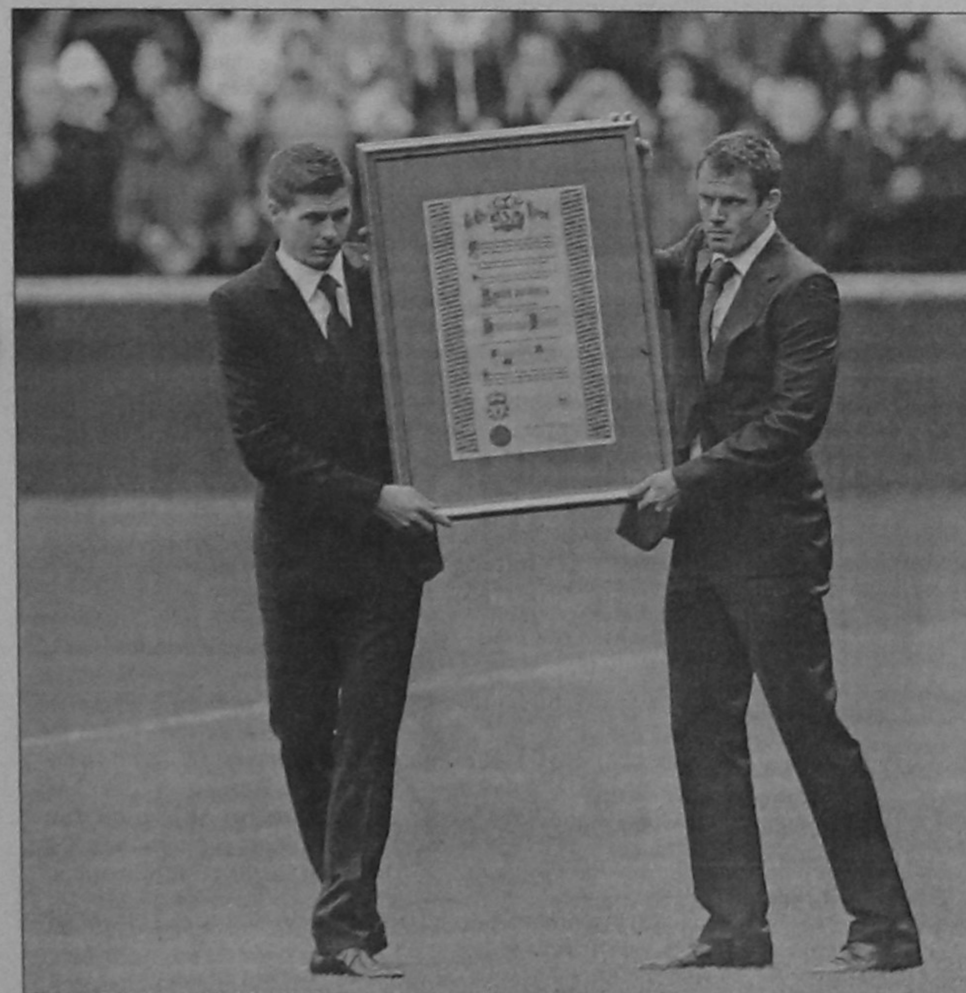
Liverpool captain Steven Gerrard (L) and Jamie Carragher present the Freedom of the City crest to the Hillsborough Families Support Group during a memorial service to mark the twentieth anniversary of the Hillsborough disaster at Anfield on Wednesday.

"I hope to get there before the end of the season, I hope to be able to give us an extra push to assure a place in next season's Champions League."