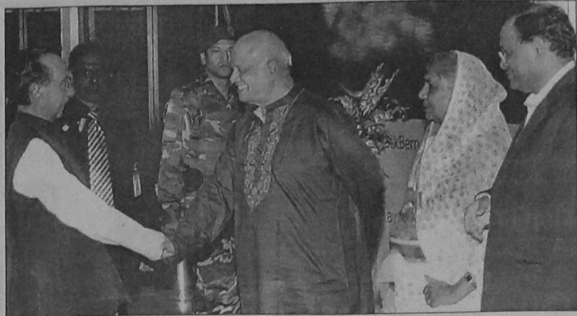
Members of the cabinet receive President Zillur Rahman at Zia International Airport in the city on Wednesday night on his return from Singapore following his medical check-up.