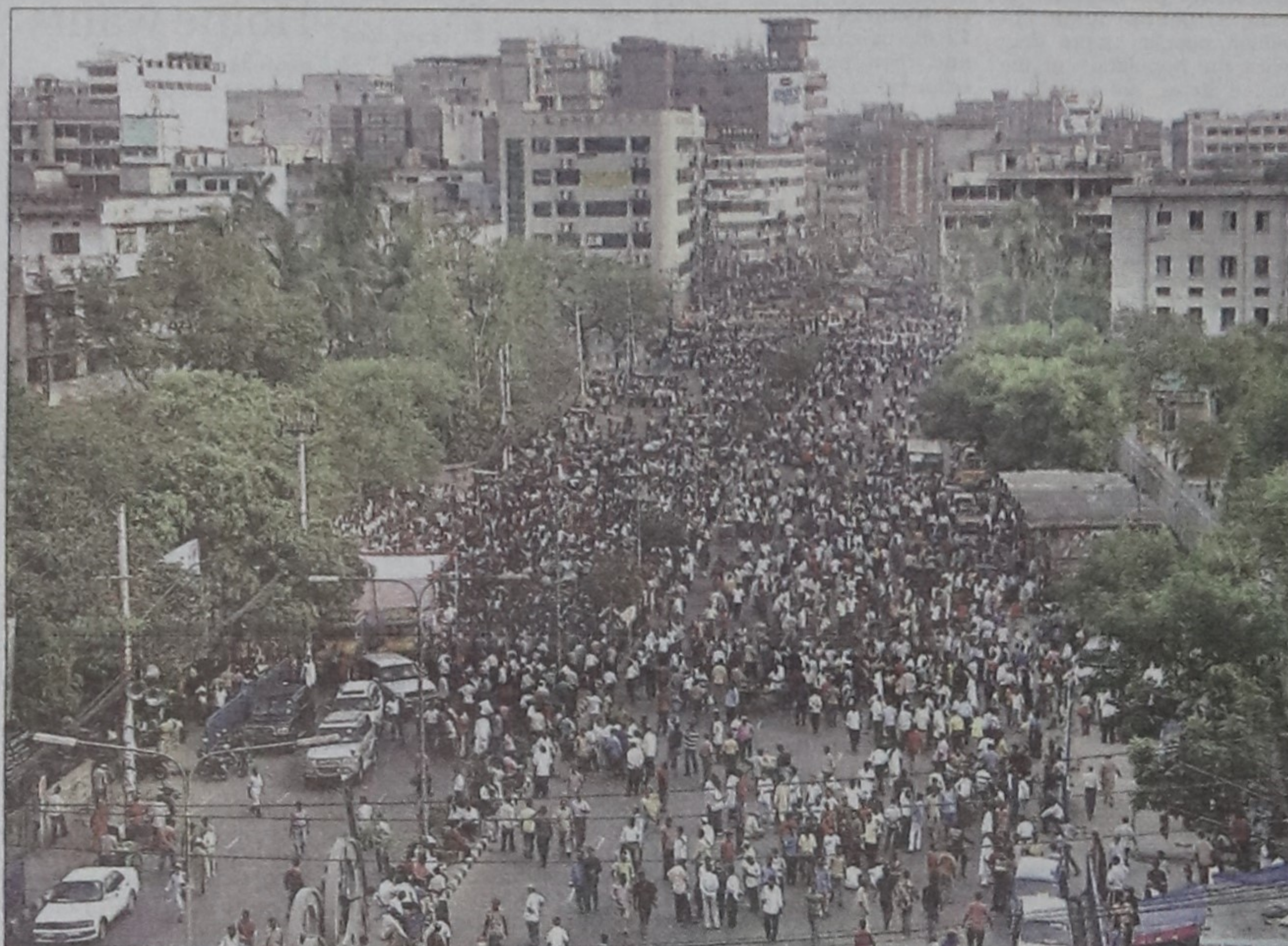
Awami League activists and supporters blocked the road at Muktangan area yesterday (picture L) while holding a gathering in support of the government decision cancelling the allotment of Khaleda Zia's cantonment residence. BNP activists held a separate gathering to protest the decision, blocking (picture R) the Purana Paltan road.