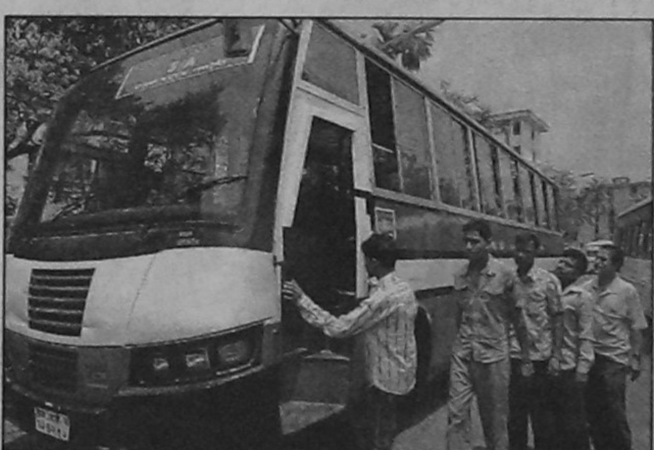
Country's first-ever Bus Route Franchise (BRF) makes its debut on the city's Uttara-Azampur route on Tuesday.