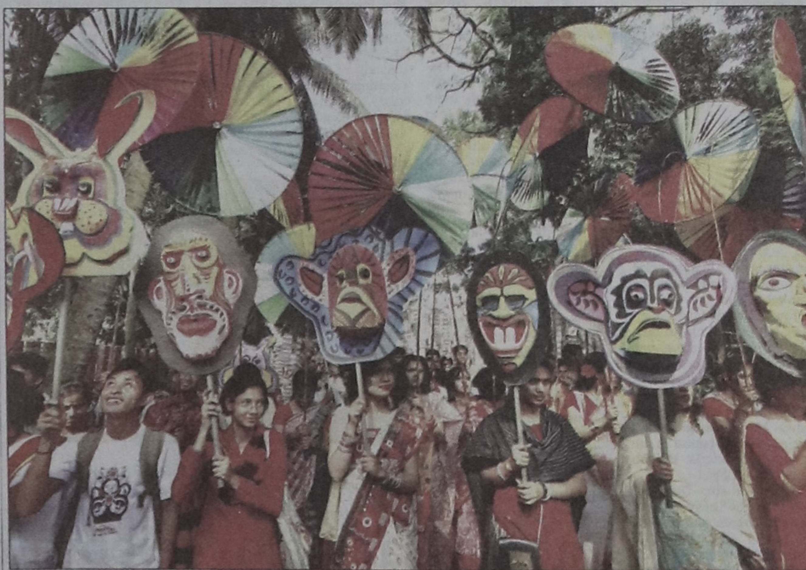
Students of the Fine Arts Institute of Dhaka University carry masks and other colourful paper crafts during a procession marking Pahela Baishakh celebrations in the city.