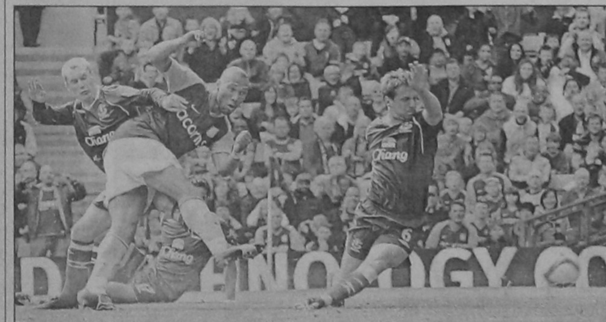
Aston Villa striker John Carew (2nd from L) shoots past Everton defender Phil Jagielka (R) to pull a goal back during their Premiership clash at Villa Park on Sunday.

"I thought it might have been an indirect freekick because all Joleon has done is put his foot up to try and get the ball," Moyes said.