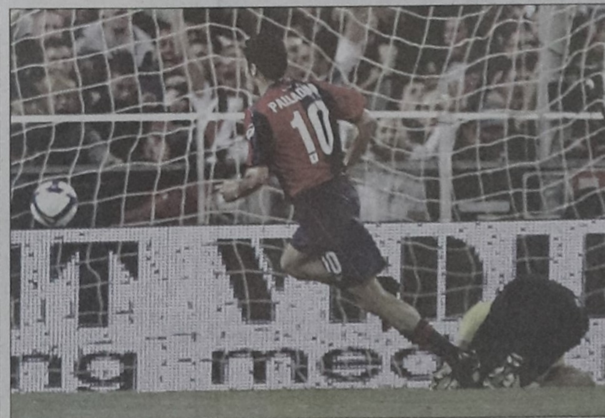
Genoa striker Rafael Palladino slots the ball past the despairing dive of Juventus goalkeeper Gianluigi Buffon to score a last-gasp winner in their Serie A clash at the Luigi Ferraris stadium in Genoa on Saturday. Genoa triumphed 3-2 to all but end the Old Lady's title aspirations.

"I'm ruling out the possibility of going to Chelsea and I don't have to give any explanations either," he said before adding tongue in cheek: "I'm ruling out Manchester United as well."