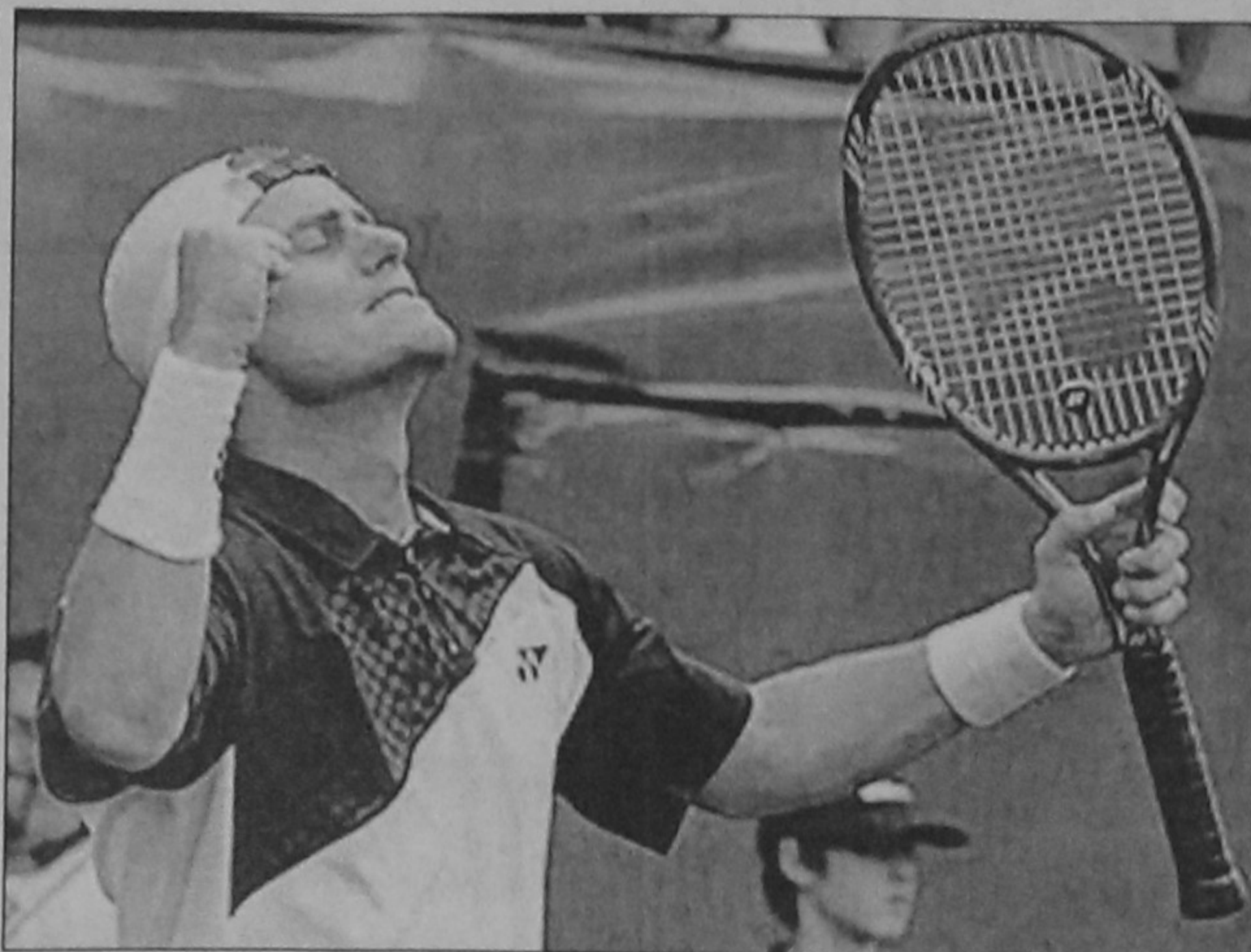
Lleyton Hewitt of Australia is ecstatic after defeating Evgeny Korolev of Russia in the US Men's Clay Court Championships semifinal in Houston on Saturday.

"Playing cricket for England was the great ambition of my life and, until I became ill, I loved everything about it..."