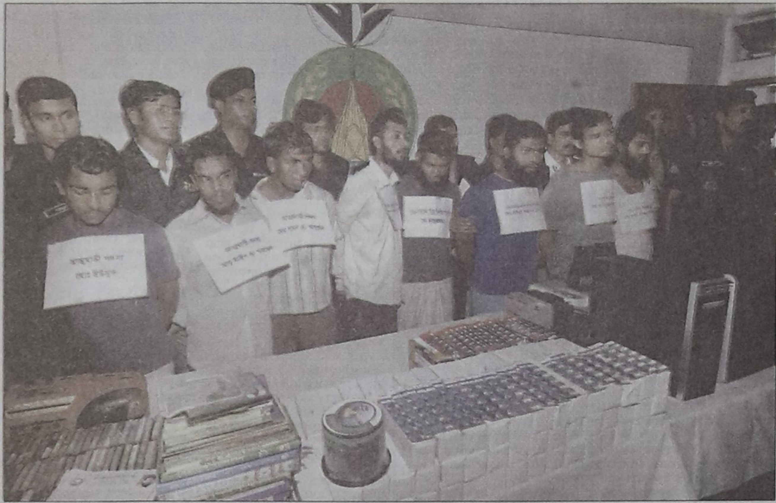
Eight JMB militants arrested by Rapid Action Battalion with bomb detonators, batteries, and books and CDs on jihad in their possession, being produced at a news briefing in Rab-1 HQ in Uttara of the capital yesterday.