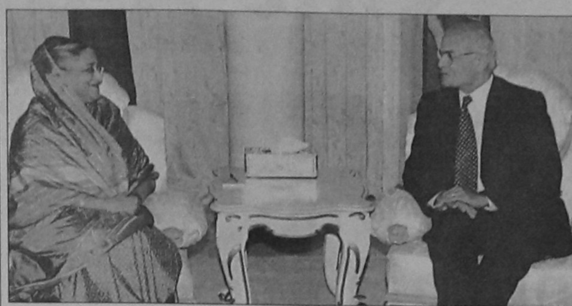
Indian Foreign Secretary Shiv Shankar Menon calls on Prime Minister Sheikh Hasina at her residence at Jamuna in the city yesterday. (Story on Page 1)

Bangladesh Manobadhikar Samonnoy Parishad in another statement yesterday said that the recently passed upazila parishad bill goes against democratic values.