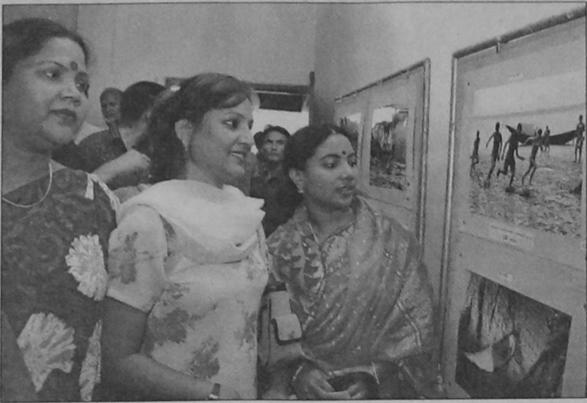
Visitors admire photos at a photo exhibition titled 'Rupasi Bangla Photo Contest' organised by Bangladesh Photojournalists Association (BPJA) at the association auditorium in the city yesterday.

during the meeting. Both hoped that bilateral relations between Dhaka and Thimpu would be strengthened in the days ahead.