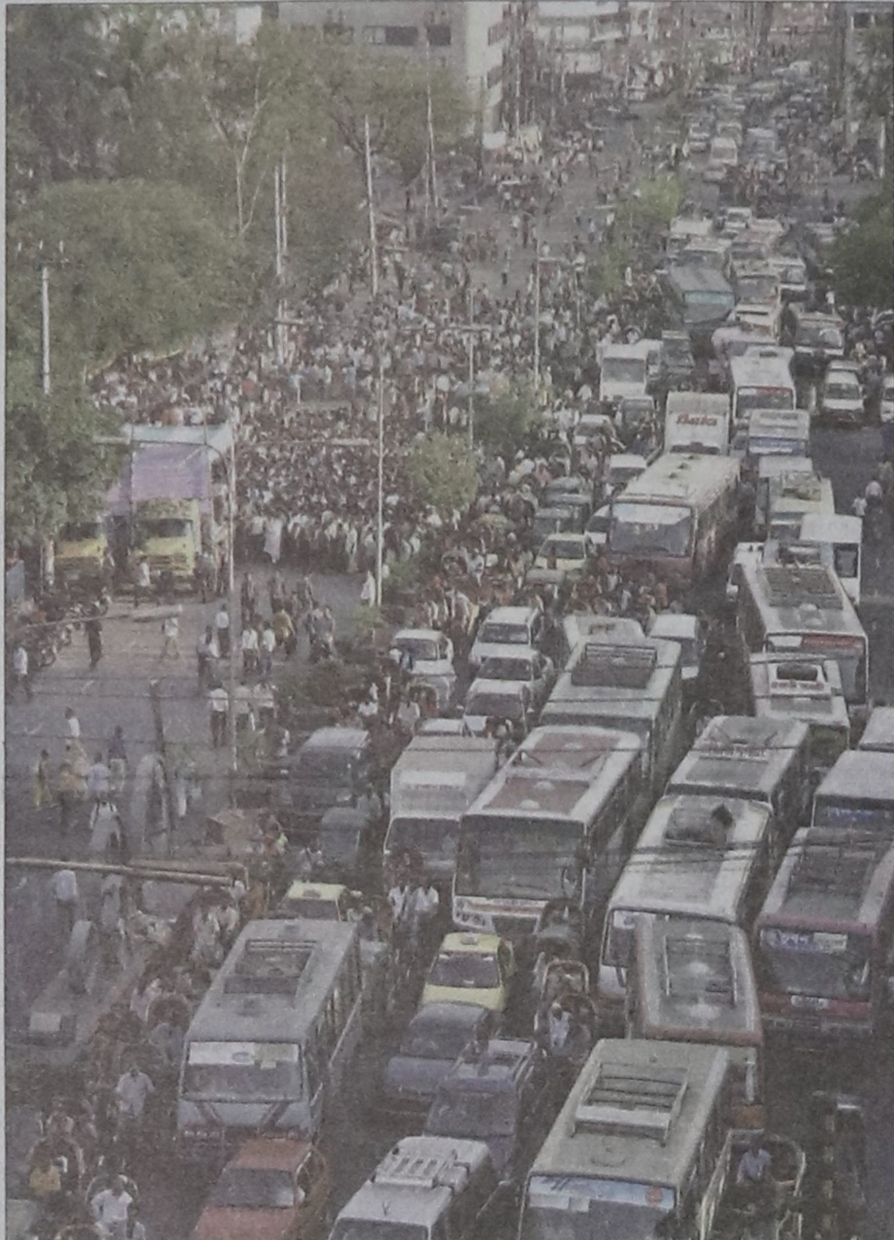
North-South Jubo League unit of Dhaka city holds a rally blocking half of the street near Muktangan yesterday welcoming the cabinet move to cancel the allotment of BNP chief's cantonment house and creating traffic jams on the already congested streets of downtown area.

Recently, he went to Singapore for treatment.