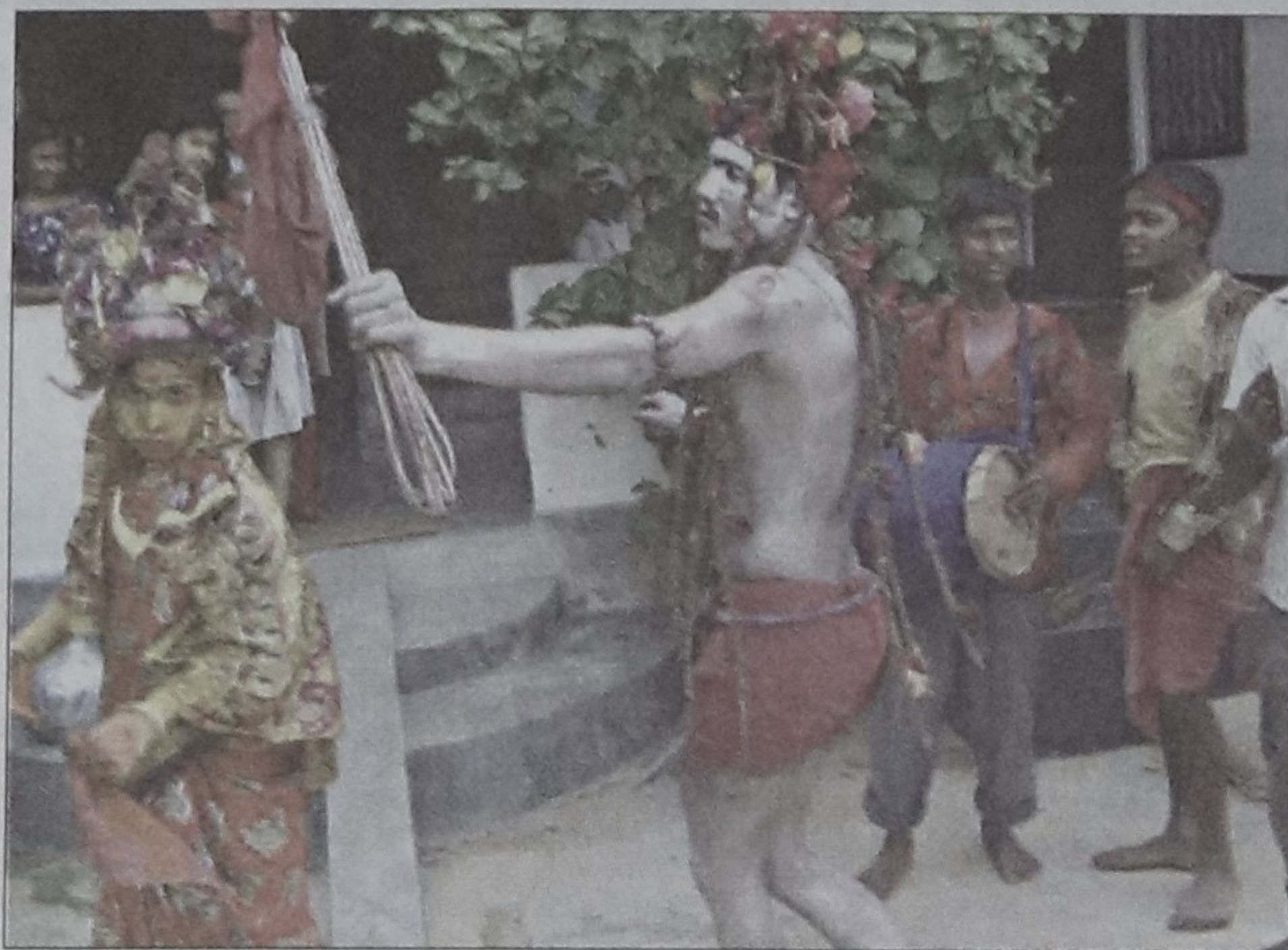
Actors perform the 'Shiva and Gauri dance' to collect funds for 'Chaitra Shangkranti' celebration.

After necessary funds have been collected, the organisers