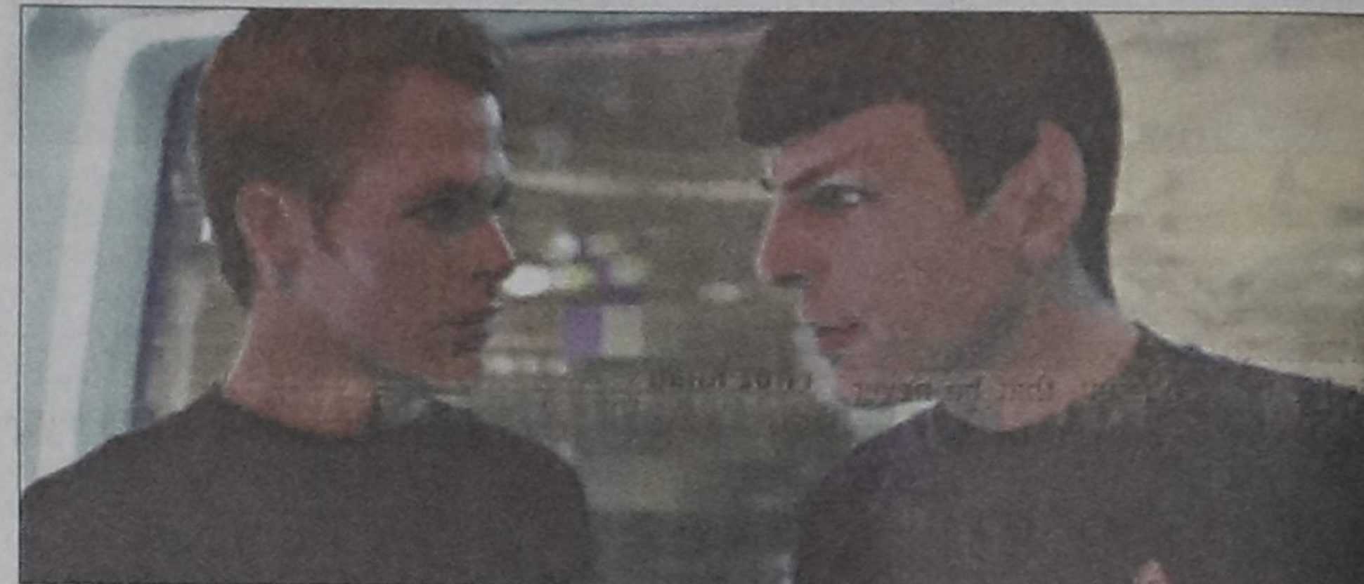
Chris Pine (left) and Zachary Quinto in "Star Trek."

"I didn't think it would be wise to do a copy of George Takei's performance," Cho said. "It just didn't seem like the right thing to do, and J.J. didn't ask me to do that, so I avoided it."