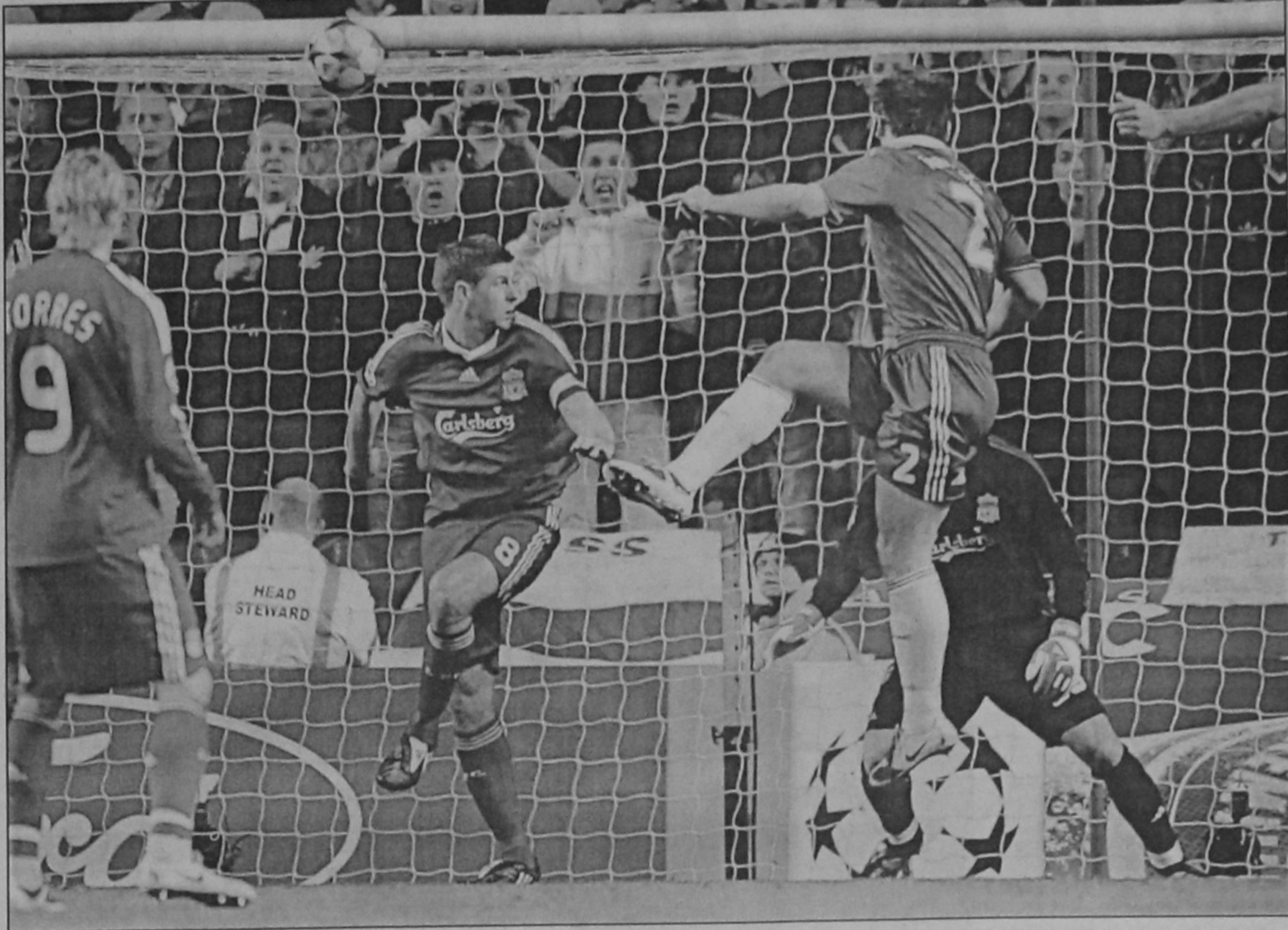
Chelsea defender Branislav Ivanovic (R) heads in his second goal against Liverpool during their Champions League quarterfinal first-leg encounter at Anfield on Wednesday.

"What I want to say is that we must now concentrate on our next match against Frankfurt on Saturday. We have to react after this second heavy defeat in a row."