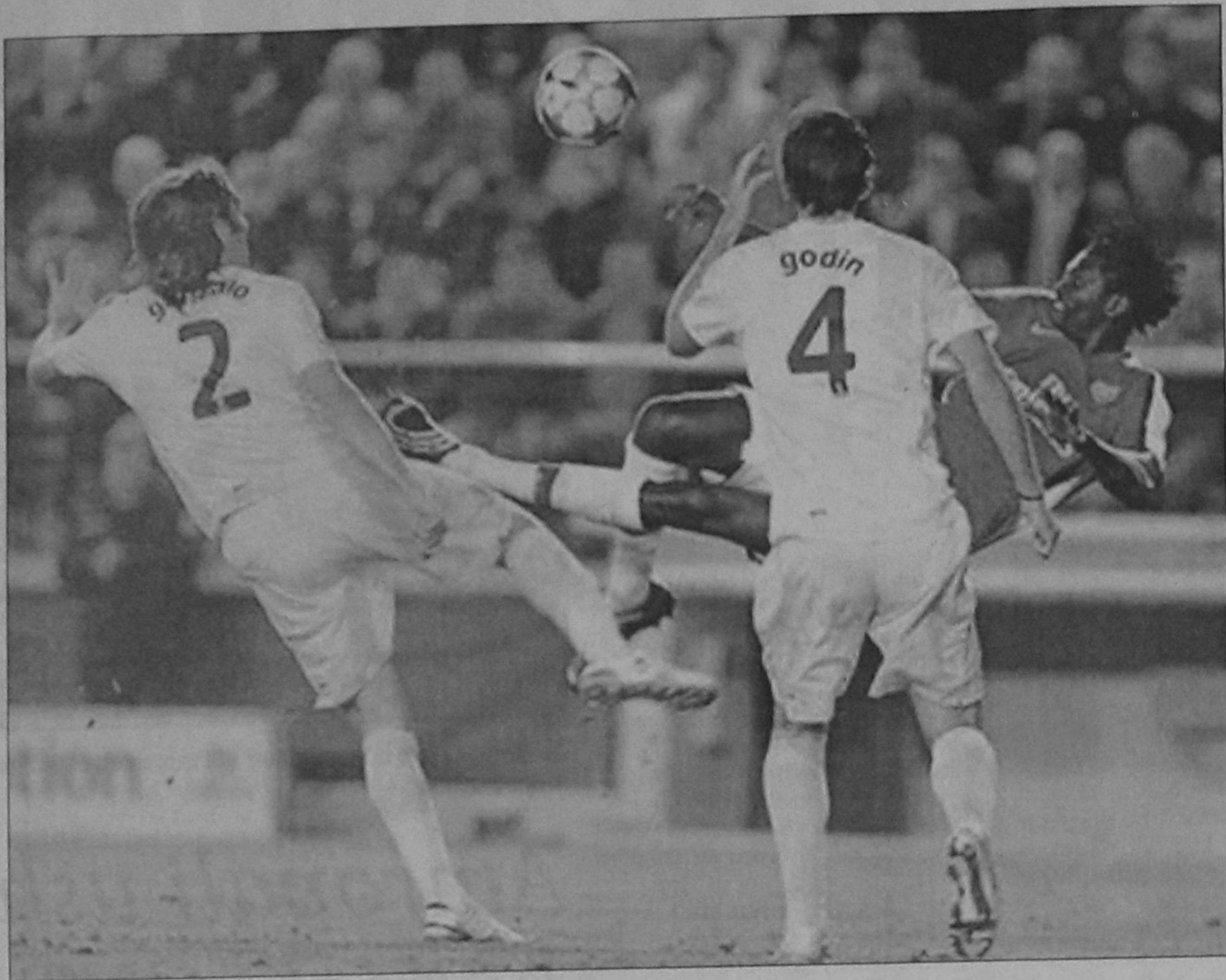
Arsenal striker Emanuel Adebayor (R) executes a perfect scissor-kick from the edge of the box to score the equaliser in their Champions League quarterfinal against Villarreal at the El Madrigal on Tuesday. Adebayor's fabulous strike meant that Arsenal got a crucial away goal in Spain.

His replacement is Germany's Far East tour in between May 26 and June 3 is in question when the national team will play China in Shanghai on May 29 and Saudi Arabia in Dubai on June 2.