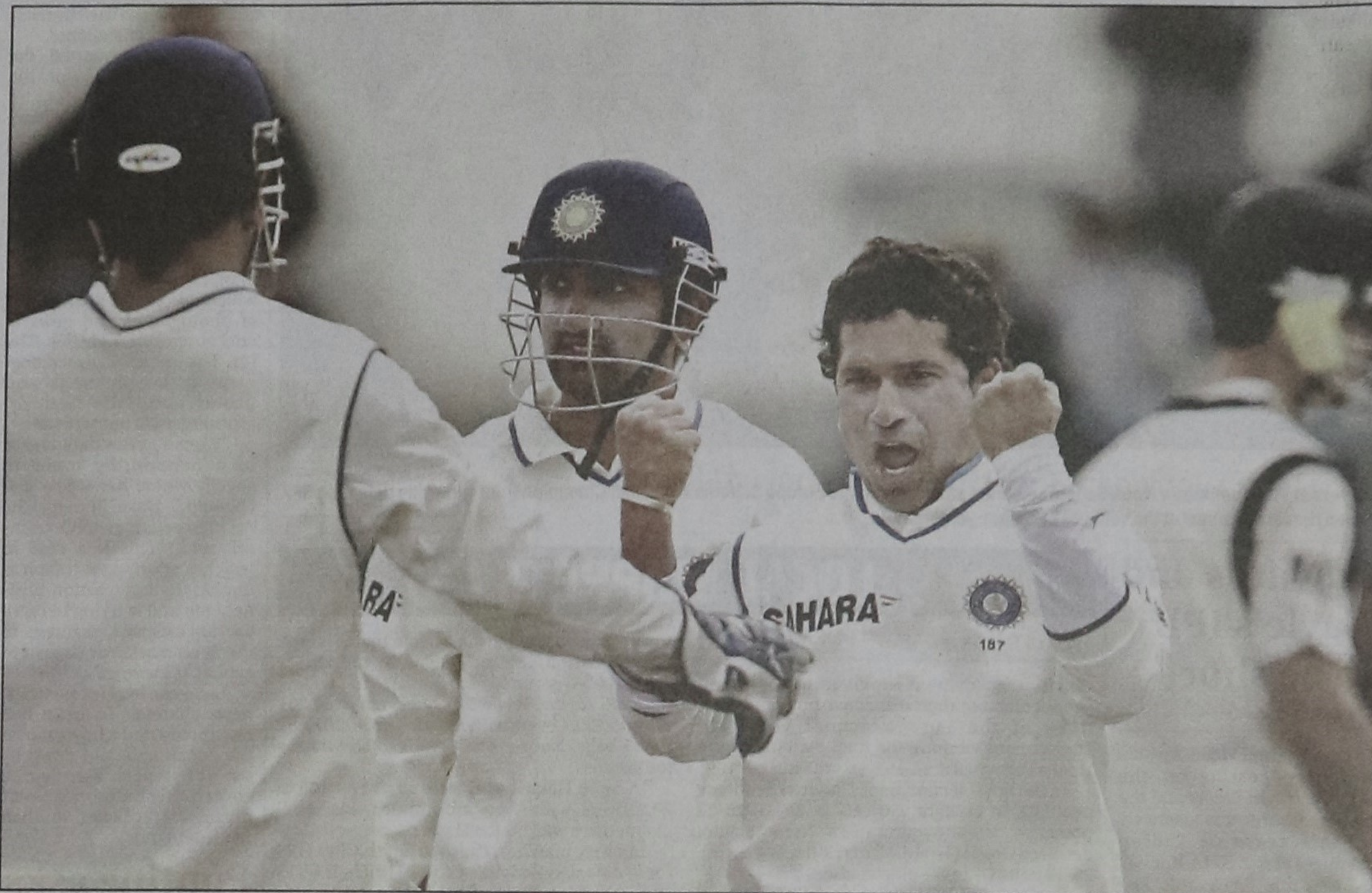
India's cricket icon Sachin Tendulkar (C) celebrates with teammates after taking the wicket of New Zealand batsman James Franklin (R) on the final day of the third Test at Basin Reserve in Wellington yesterday. Although rain denied India a victory in the final Test, the visitors won the series 1-0. It was also India's first series victory in New Zealand since 1968.