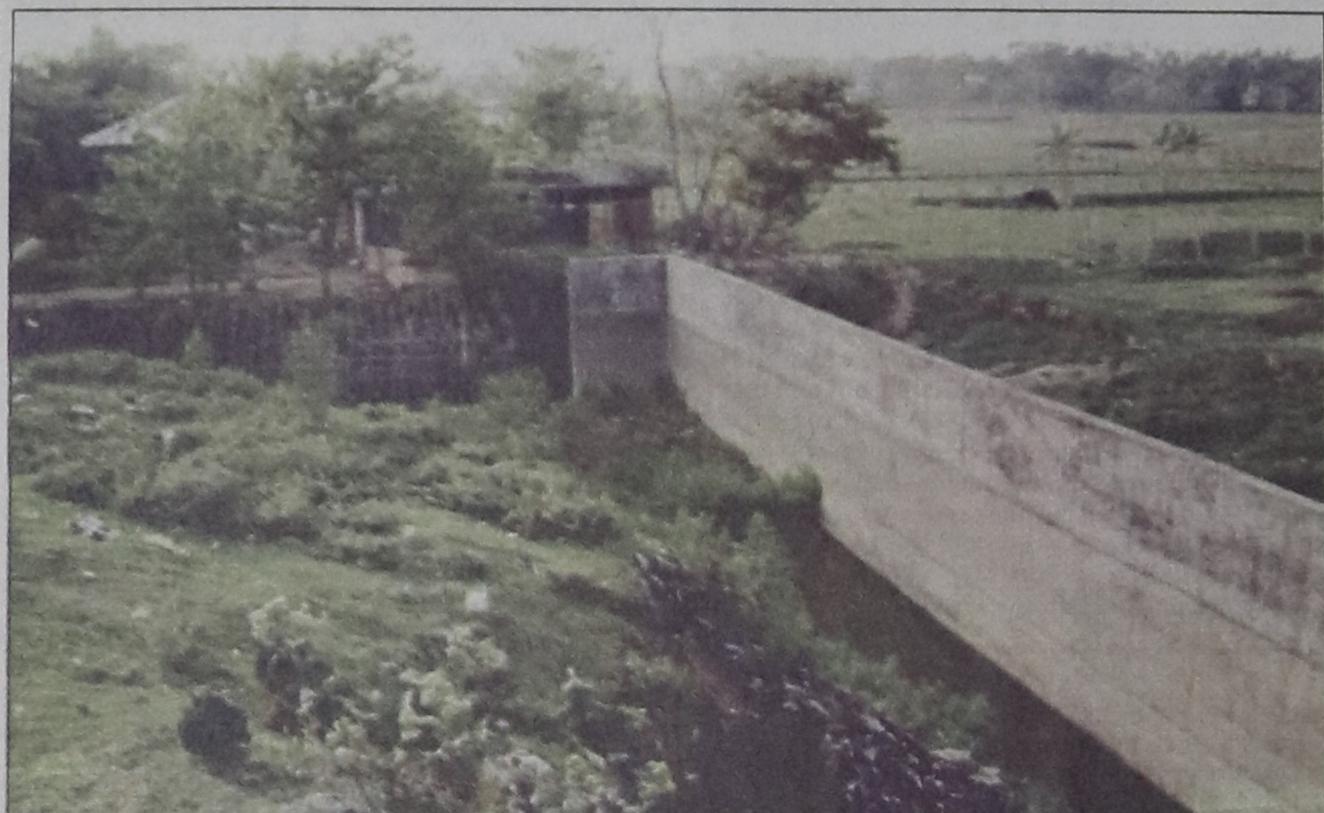
Unscrupulous people have occupied and filled up a part of Telikhali Chhara, changing course of the natural water outlet flowing through Sylhet city.

Agitating businessmen also staged a two-hour sit-in demonstration in front of the market. Later, a rally was held where the businessmen protested the RDA bid for inviting tender for construction of a multi-storied building demolishing south portion of the market without consulting them.