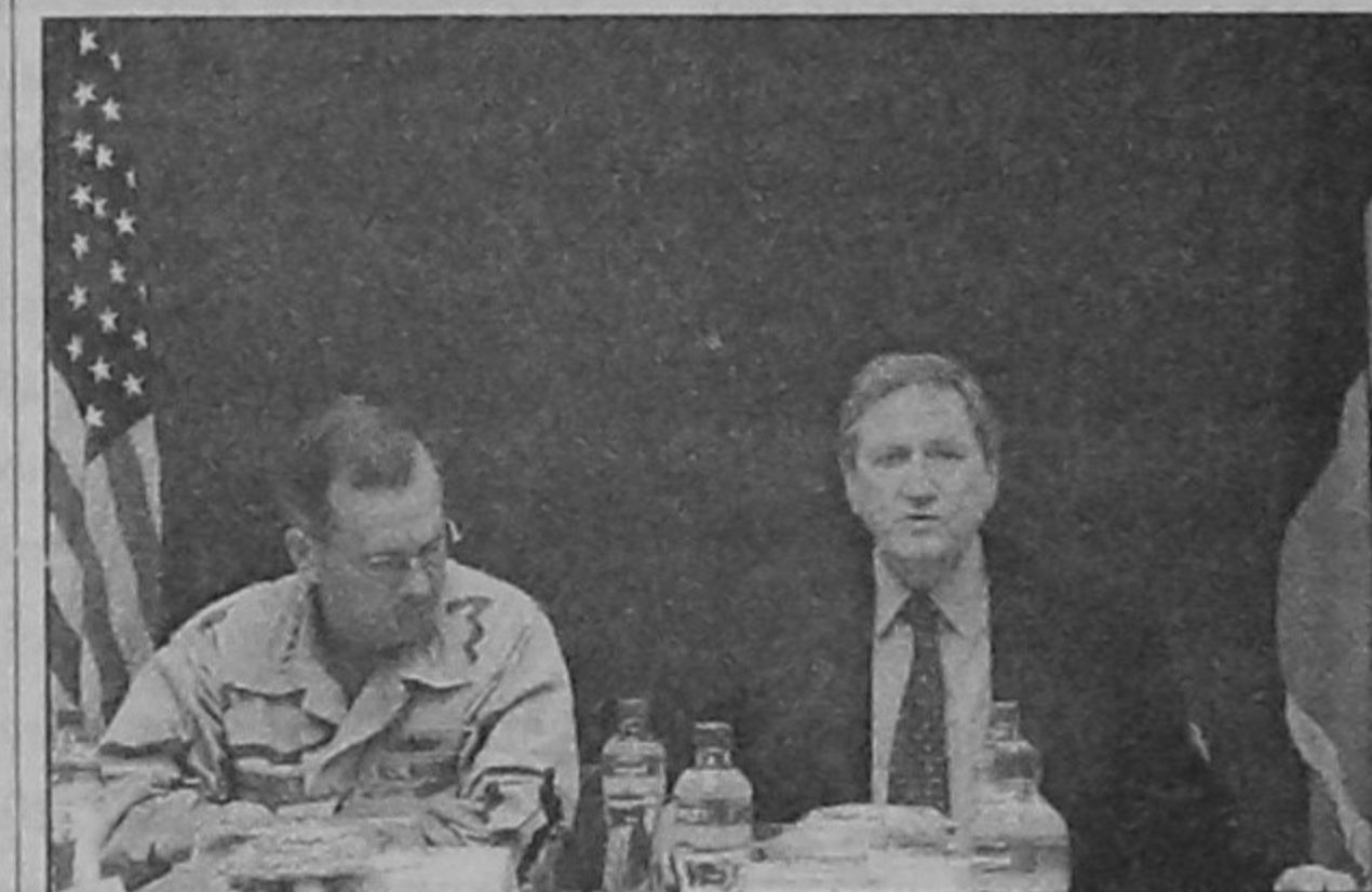
US special envoy for Afghanistan and Pakistan Richard Holbrooke (R) speaks during a press conference as the chairman of the Joint Chiefs of Staff, Admiral Mike Mullen (L) looks on at the US embassy in Kabul yesterday. The top US military commander and special envoy arrived in Kabul for high-level talks, a US official said, after Nato backed a new US strategy for the region.

Mukherjee was asked about a US bill seeking to triple non-military aid to Pakistan to a whopping USD 1.5 billion annually while asking Islamabad to stop supporting terror groups active in India.