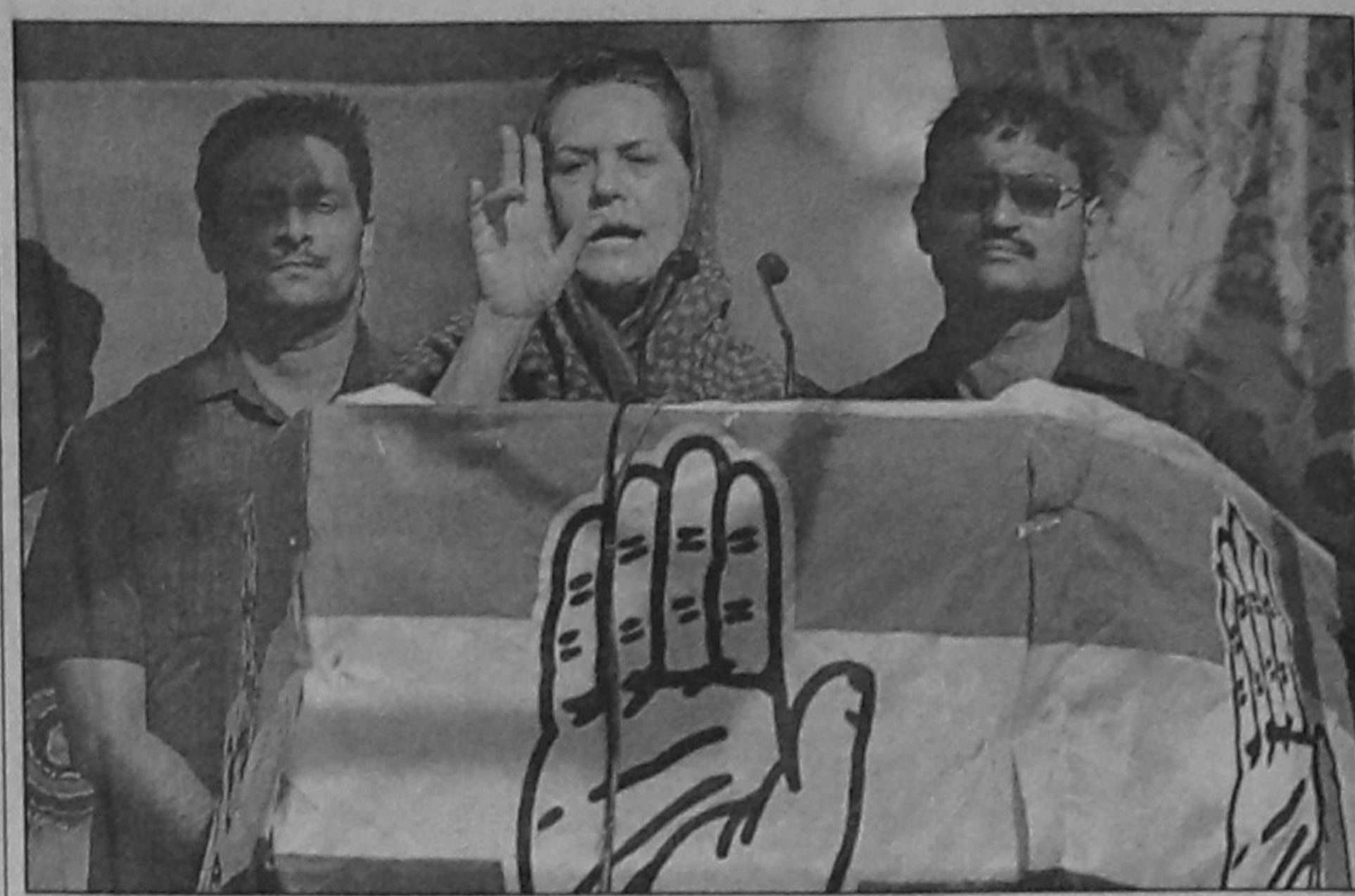
Congress President Sonia Gandhi addresses a rally in Varanasi yesterday. India holds its 15th parliamentary general elections in five phases on April 16, April 23, April 30, May 7 and May 13 and the new Parliament will be constituted before June 2.