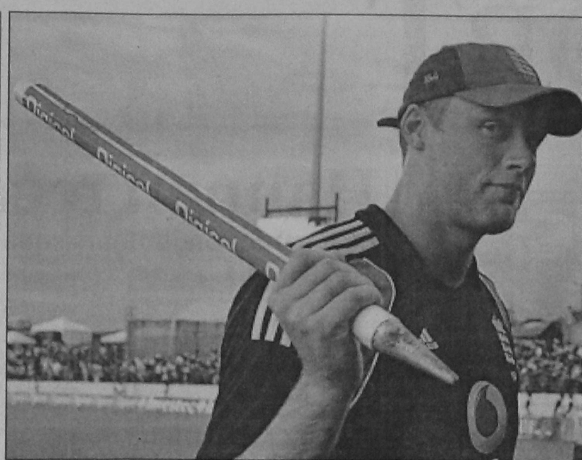
HATTRICK HERO: England allrounder Andrew Flintoff walks off with a souvenir after beating West Indies in the fifth and final one-day international in St Lucia on Friday. Flintoff finished with 5 for 19.

O'Brien 5 2 8 0, Franklin 3 0 15 0, Ryder 1 1 0 0