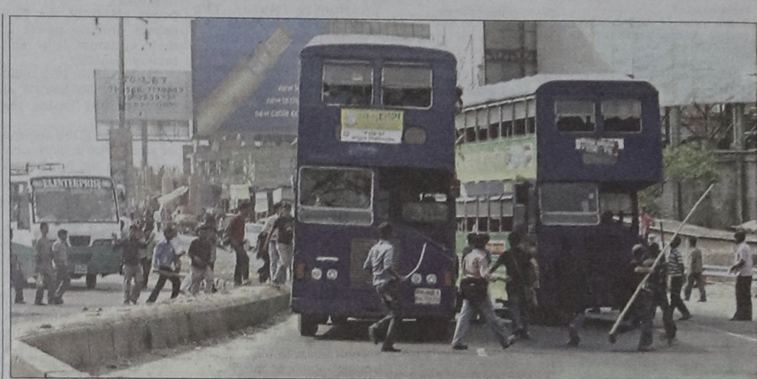
Students of Jagannath University clash with transport workers at Sanir Akhra on Dhaka-Chittagong Highway yesterday. Several vehicles also got vandalised during the clash. Story on page 2.