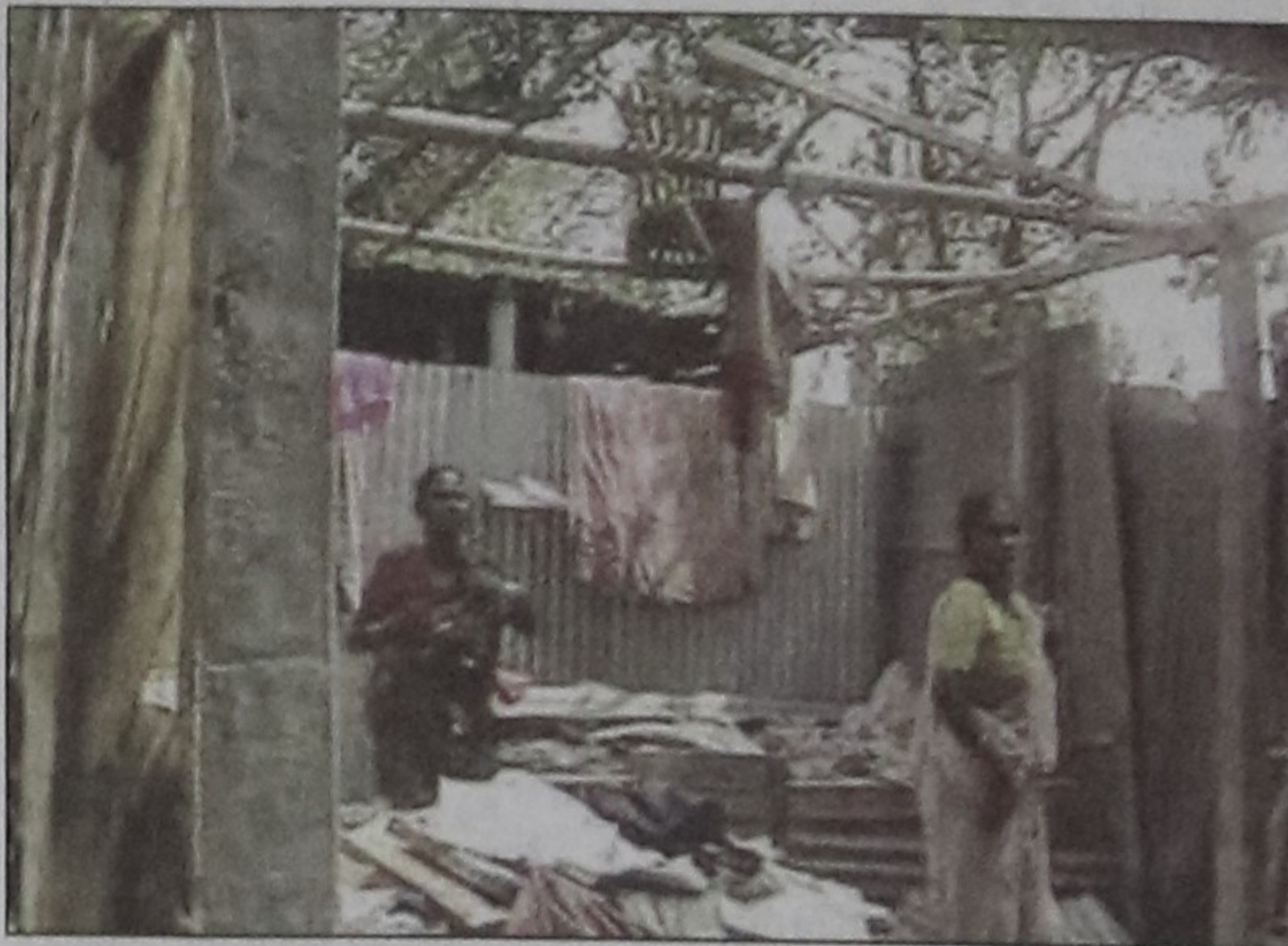
A house and a school destroyed by Friday night's nor-wester that battered Kalpur upazila in Sirajganj district.

"Crimes like rape cannot be compromised through arbitration. If such so-called arbitration is allowed, crimes including torture on women and children will increase," said a police officer seeking anonymity.