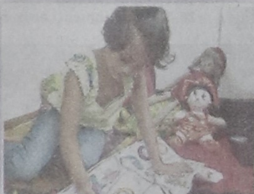
Education Savings Scheme