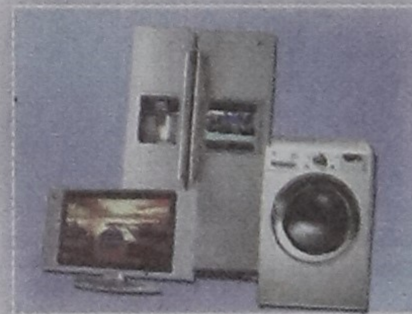
Household Durables Loan