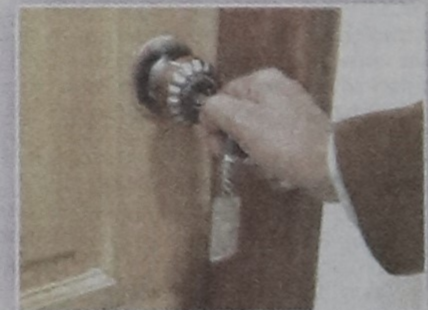
Flat Loan Scheme