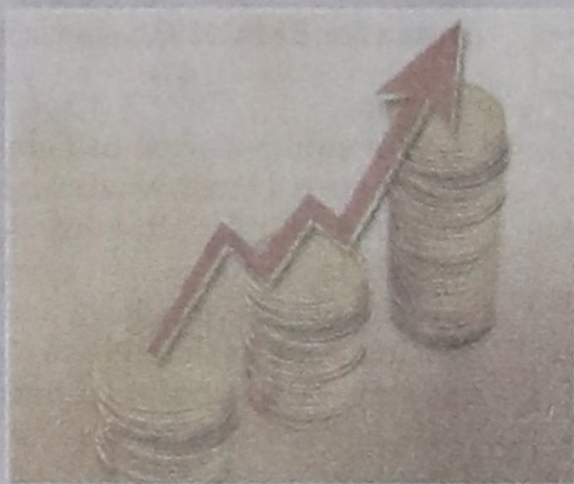
Pubali Savings Scheme