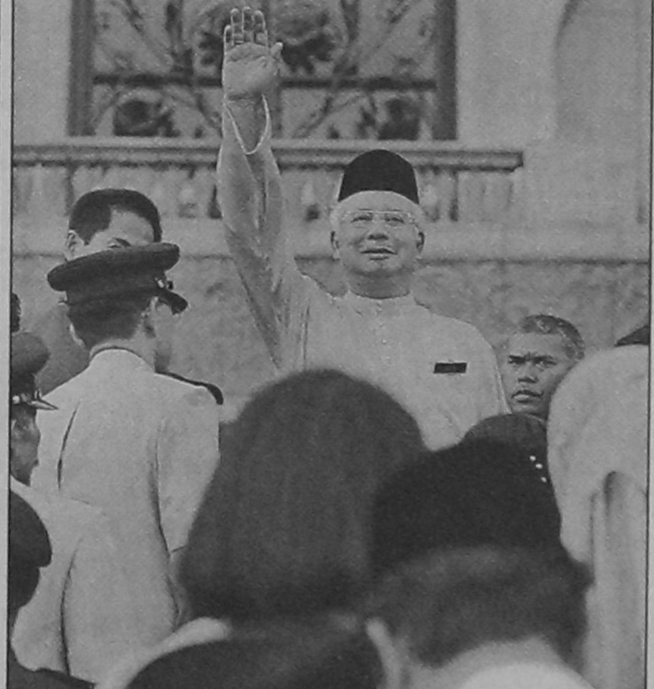
Malaysia's new Prime Minister Najib Razak waves as he enters the prime minister's office after seeing off the former premier Abdullah Ahmad Badawi in Putrajaya yesterday.

AFP, Paris A new antibiotic has passed a key phase in a test of drugs aimed at shortening the time to cure tuberculosis, offering a potential boon in the fight against TB, according to a study reported in The Lancet today. The standard treatment for TB is a course of drugs that takes up to six months -- a time that is so long that many patients, believing they are cured because they no longer feel symptoms of the disease, abandon the therapy. As a result, they may not have been completely cleared of the germ that causes TB, and this enables the microbe to mutate into a drug-resistant form or be passed on to other individuals.