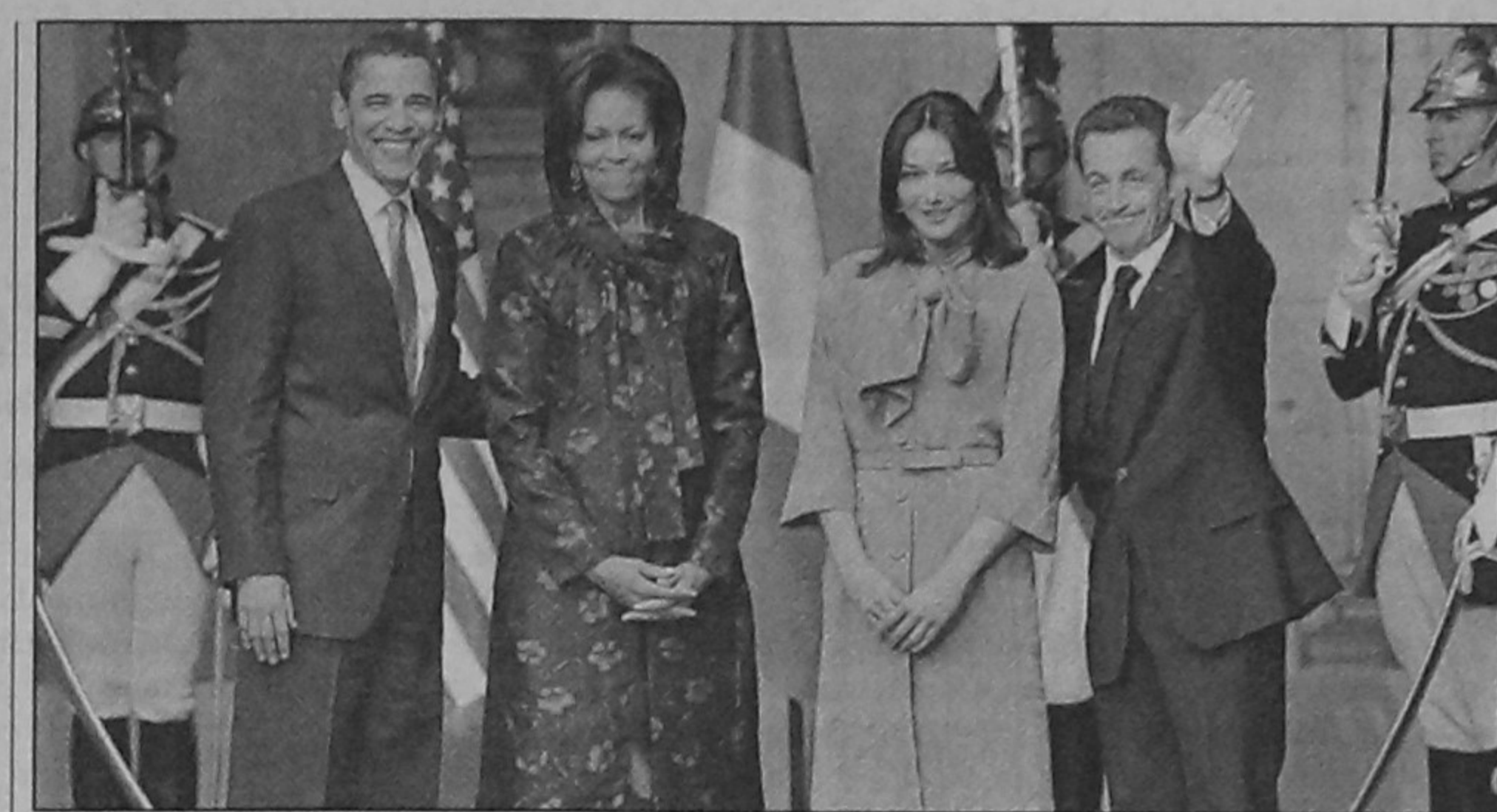
(L to R) US President Barack Obama, first lady Michelle Obama, France's first lady Carla Bruni-Sarkozy, and French President Nicolas Sarkozy are pictured on their arrival at the Palais Rohan for the Nato summit in Strasbourg yesterday.

AFP, New Delhi India has tightened security and is ready to deal with any militant attacks during campaigning for general elections set to start in mid-April, a cabinet minister said Thursday. "There is no need for panic and alarm as the country has been put on a high level of security to ensure peaceful polls," Home Minister P. Chidambaram told a news conference in New Delhi. At the same time, he said the overall security situation in South Asia had deteriorated "so we have to be on guard." India has assigned more than two million security personnel and police officers for the elections, which begin April 16 and end May 13. Many candidates contesting the world's biggest exercise in democracy have demanded tighter security amid warnings about possible attacks by Islamic militants from Pakistan during the five-phased polls. However, "much of that is not true," Chidambaram said, referring to the warnings.