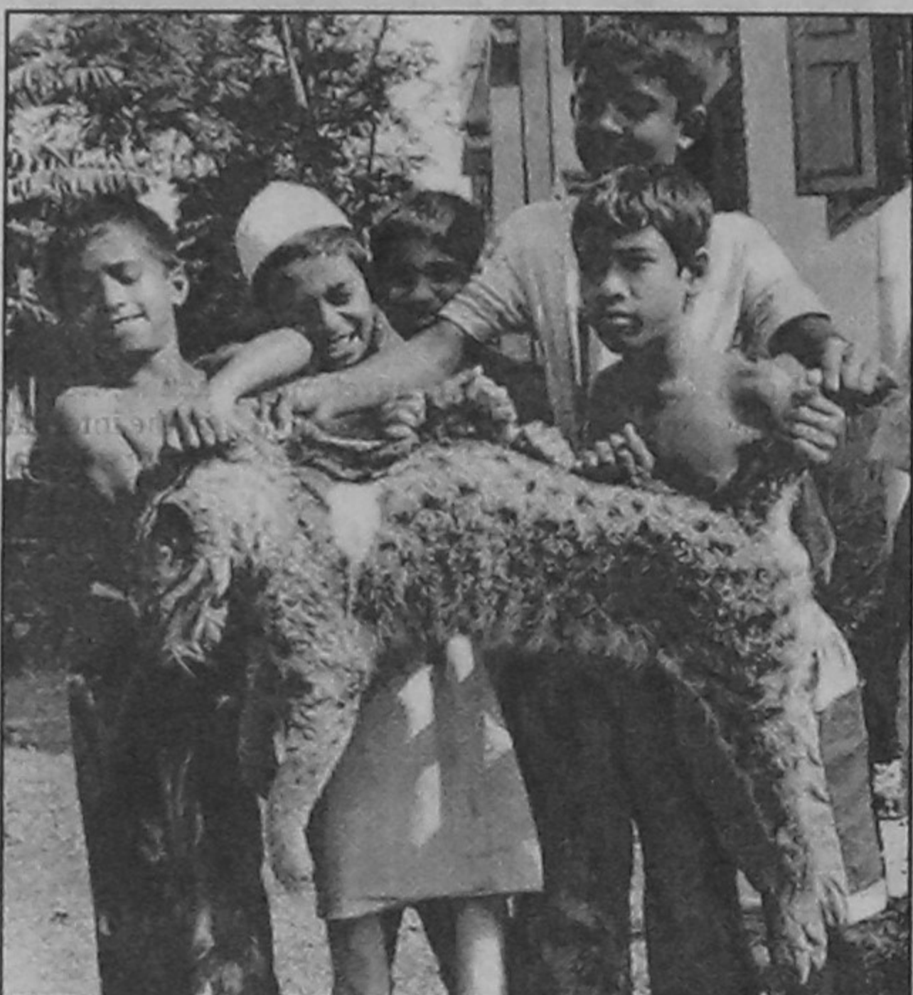
Locals beat dead this fishing cat, thinking it to be a tiger, as the rare species attacked a goose at Mirzarchar in Banshkandi under Shibchar upazila of Madaripur district on Thursday.