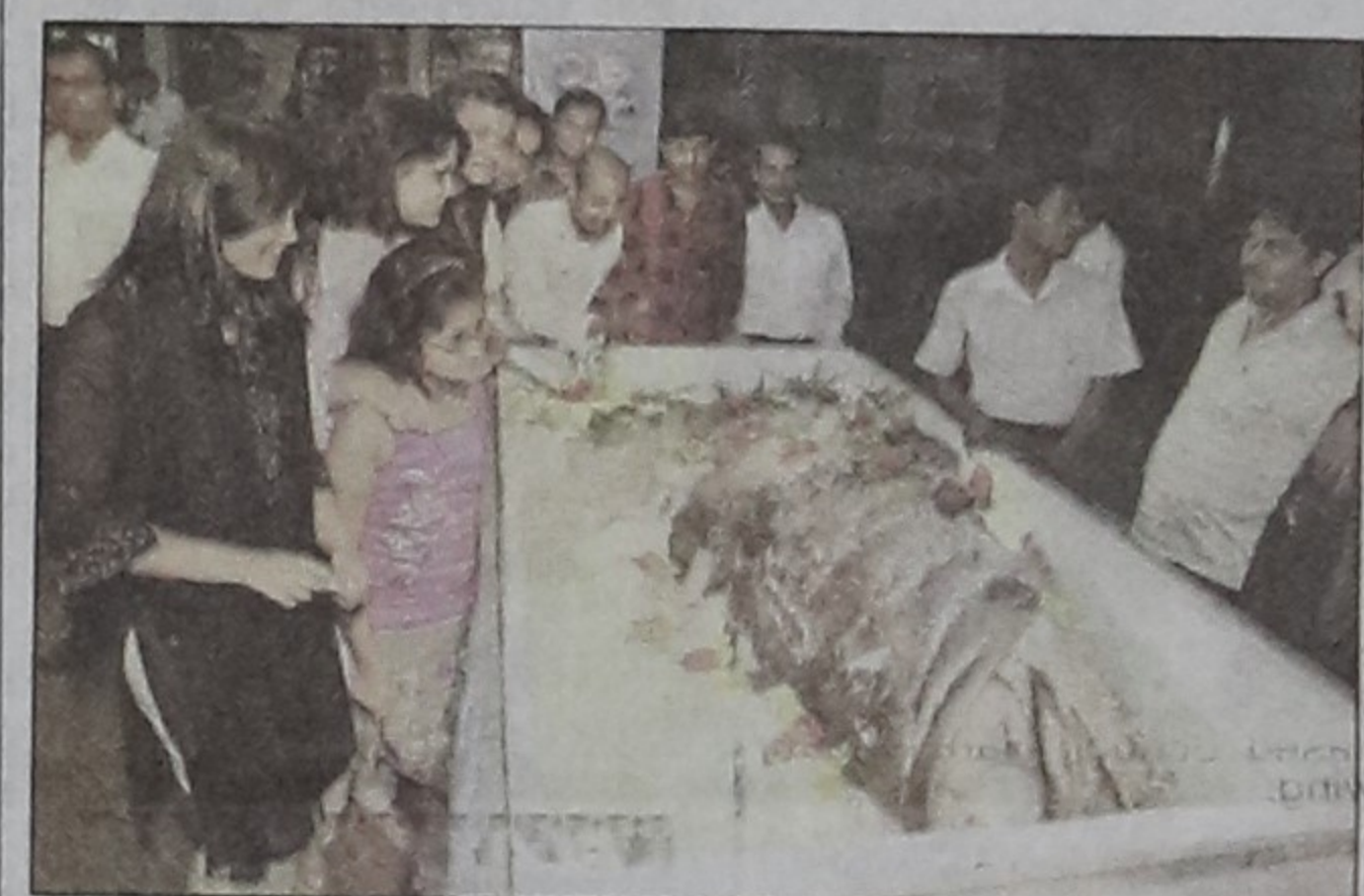
Dhaka Club hosted a Sea Food Festival on the club premises in the city on Thursday. Peninsula Sea Food Ltd. sponsored the event as part of its awareness programme about health benefits of seafood.

The researchers noted one benefit of less ice in the Arctic: "a boon for shipping and for extracting minerals and oil from the seabed."